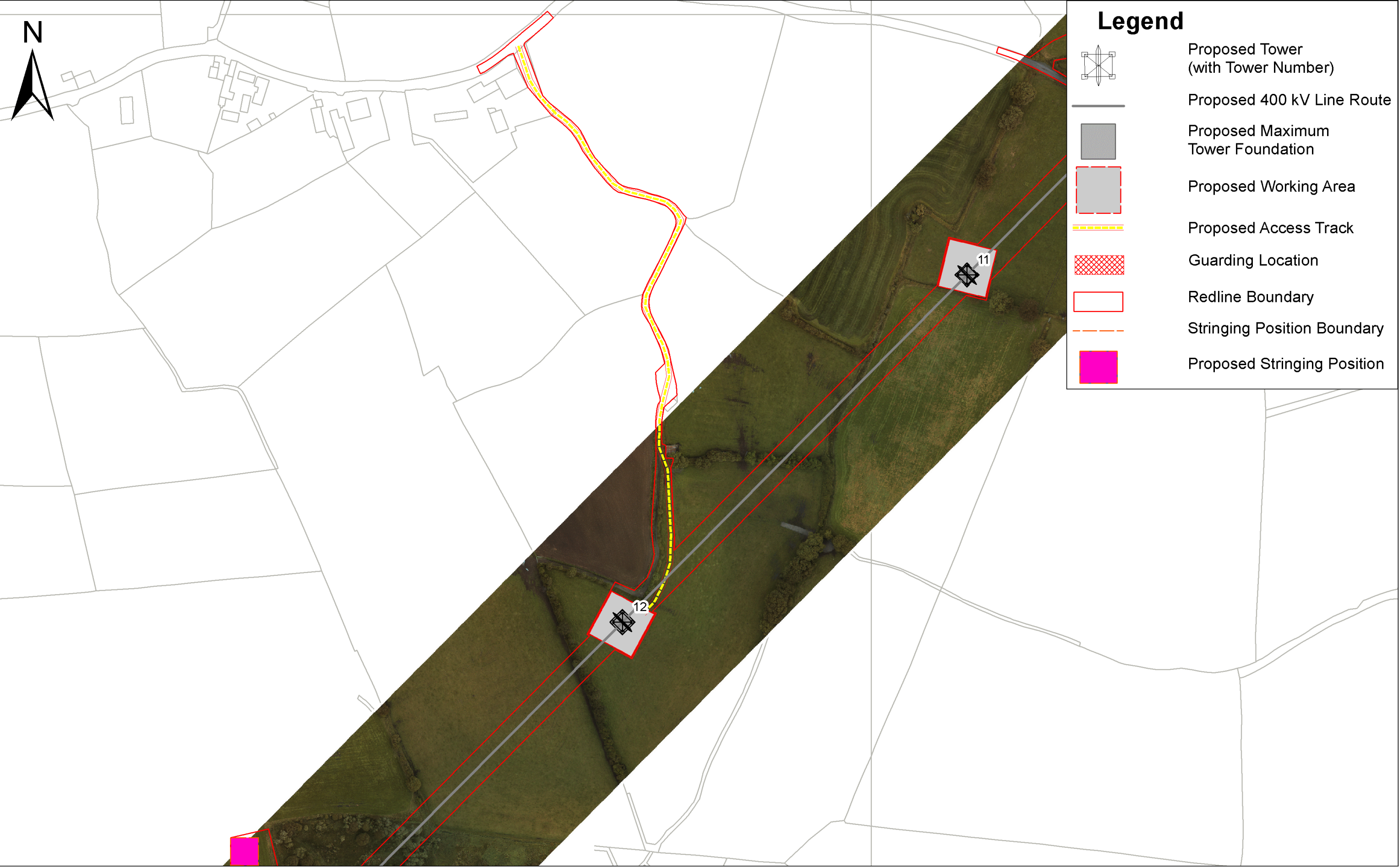
View 1: 1/2,500