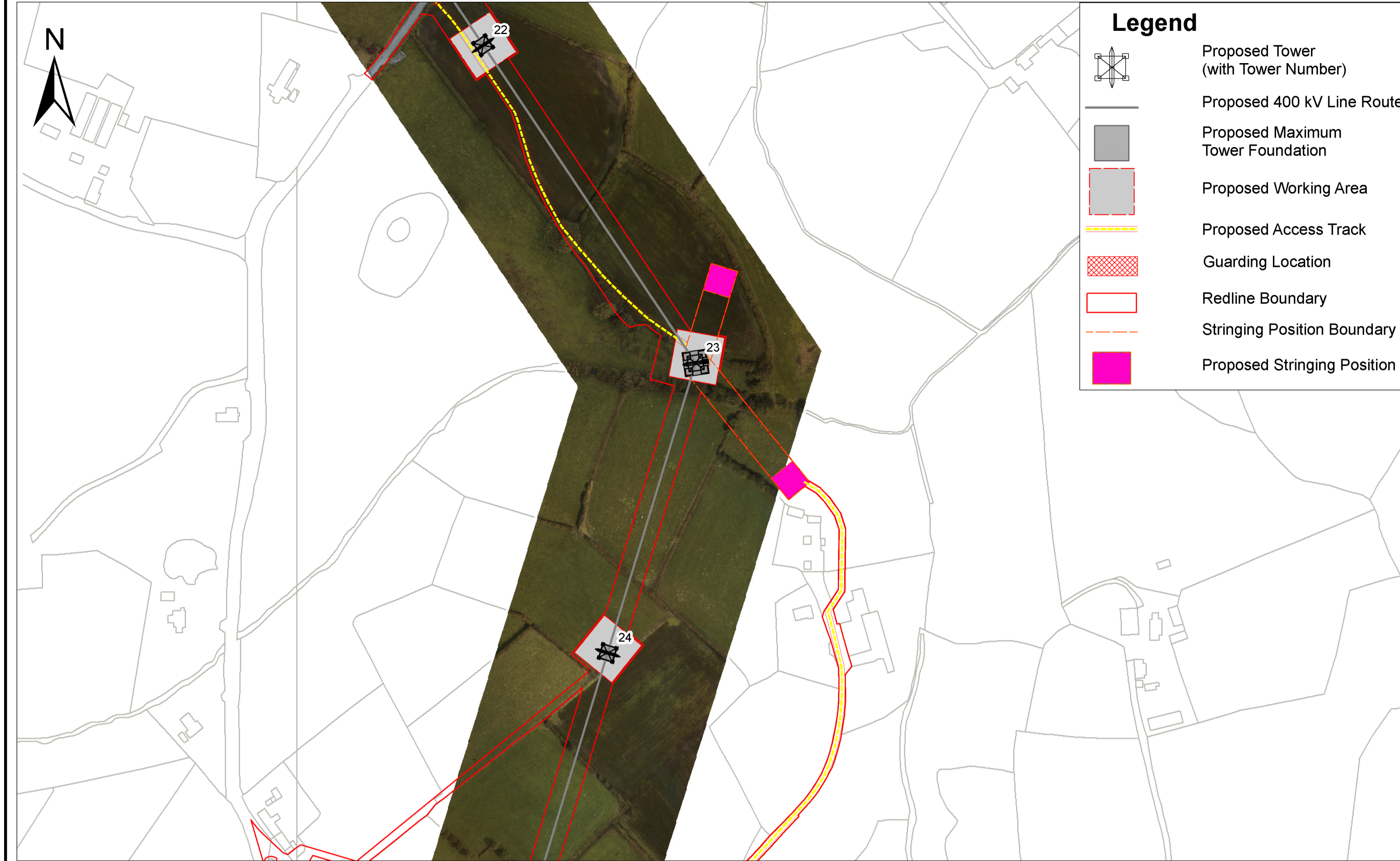
View 1: 1/2,500