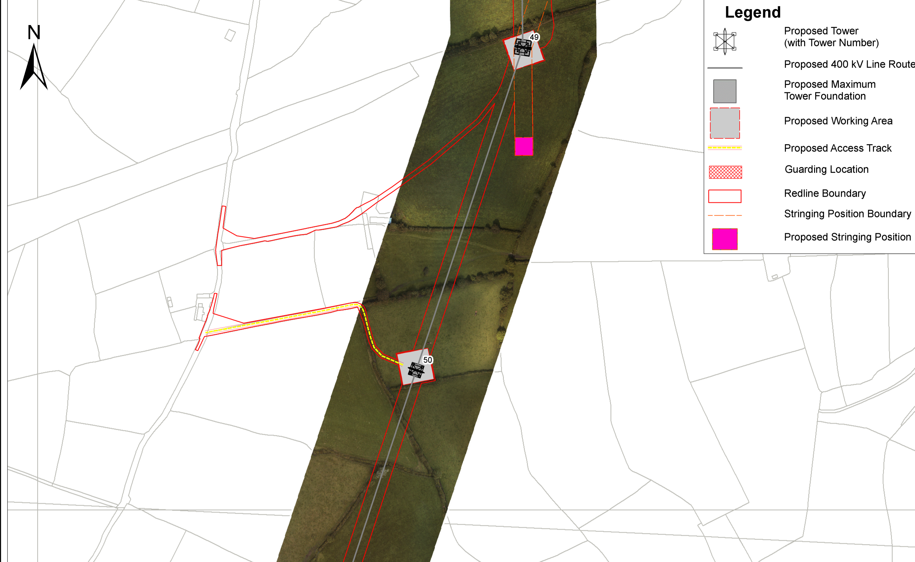
View 1: 1/2,500