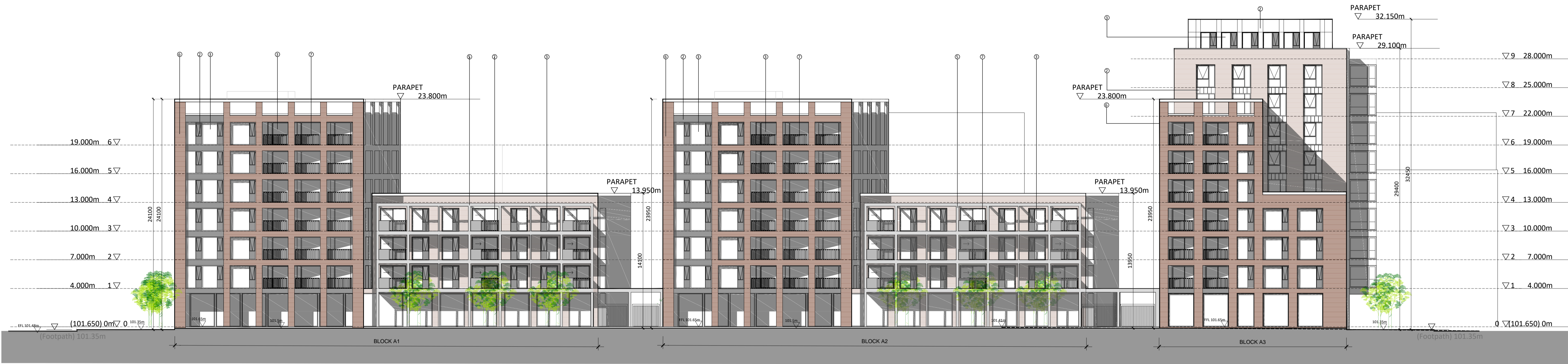
SOUTH CONTEXTUAL ELEVATION SECTOR 1 - ELEVATION AA SCALE 1:200