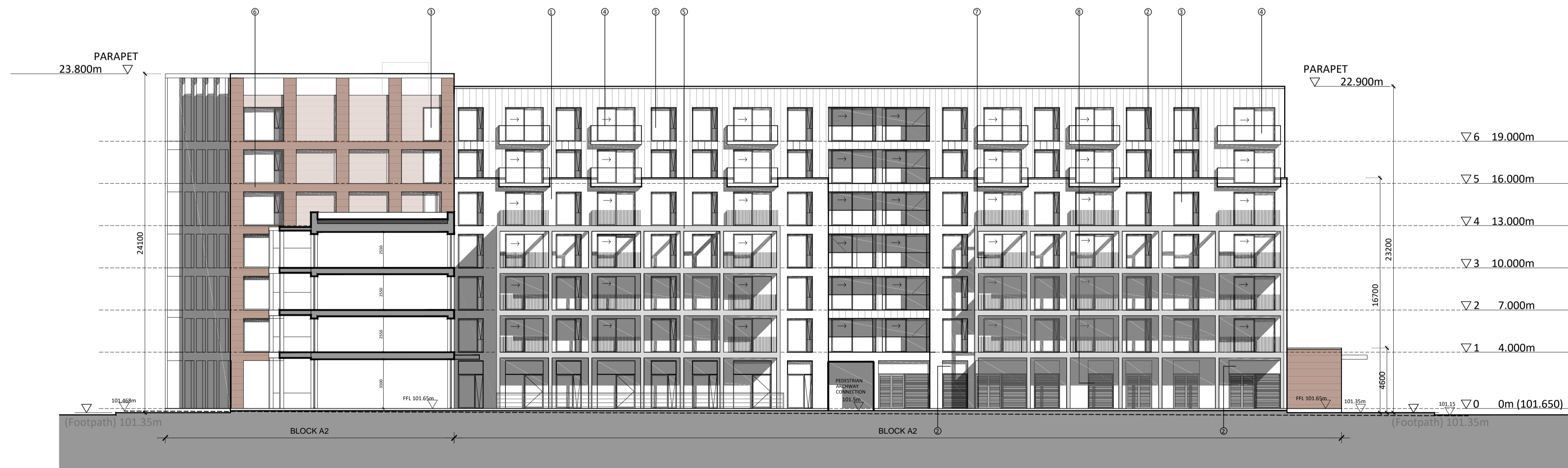
WEST CONTEXTUAL ELEVATION SECTOR 1 - ELEVATION BB SCALE 1:200