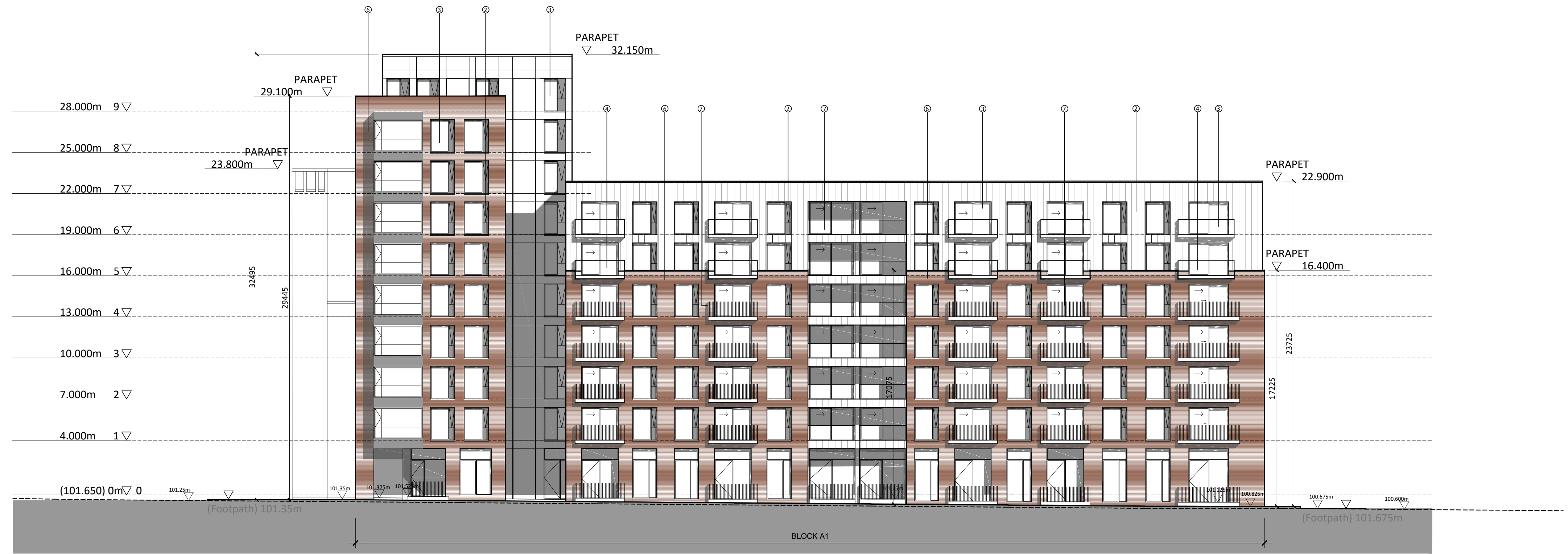
WEST CONTEXTUAL ELEVATION SECTOR 1 - ELEVATION DD SCALE 1:200