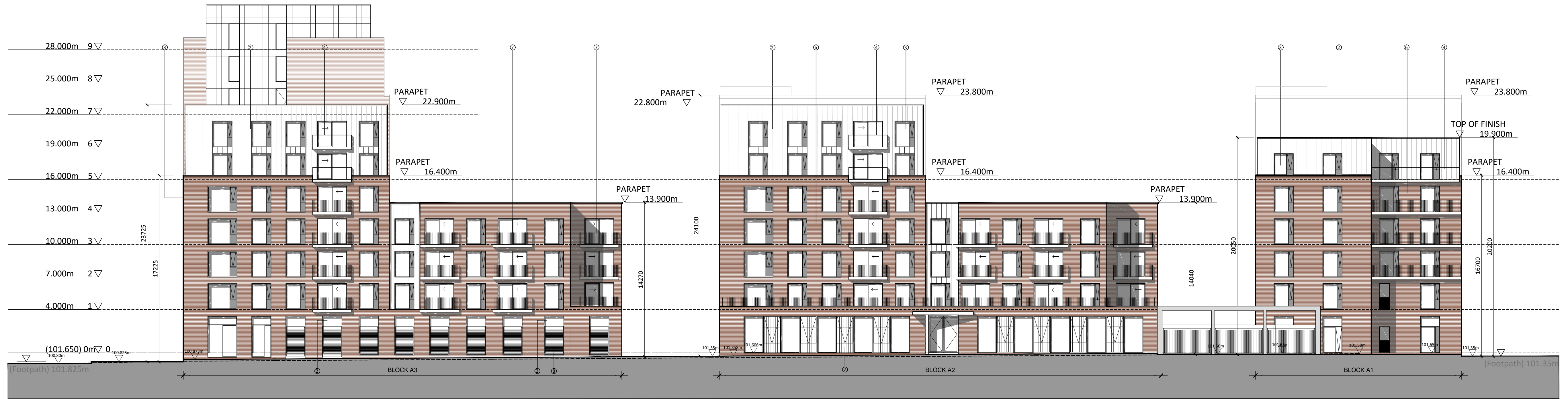
NORTH CONTEXTUAL ELEVATION SECTOR 1 - ELEVATION CC SCALE 1:200