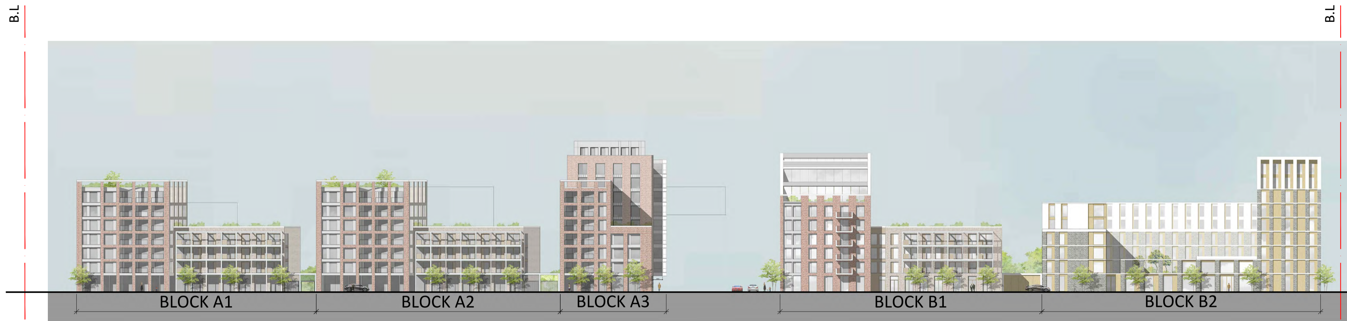
Phase 01 Contextual South Elevation