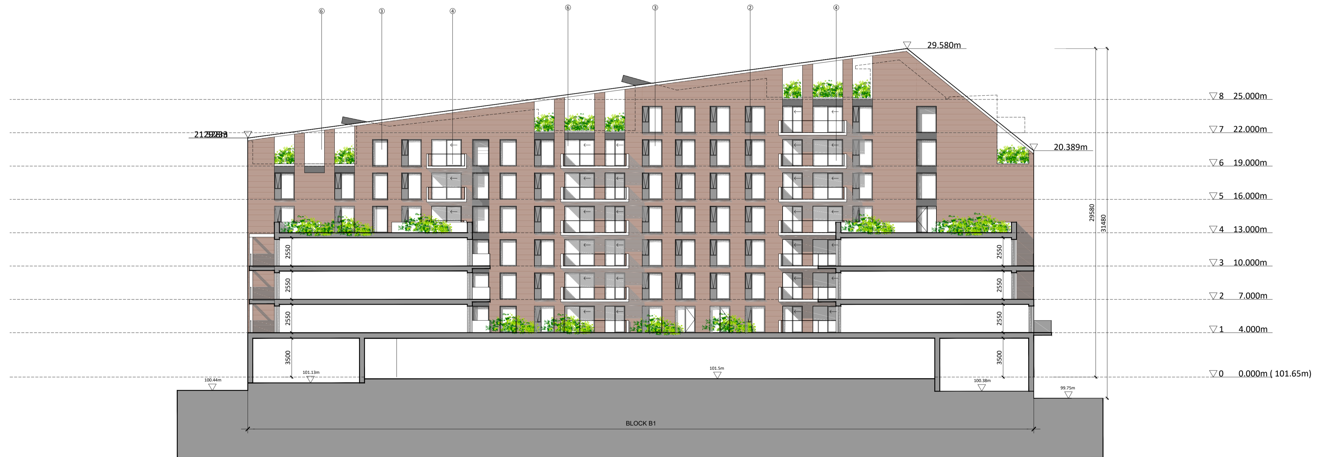
CONTEXTUAL SECTION ELEVATION SECTOR 2 & 3_MM SCALE 1:200