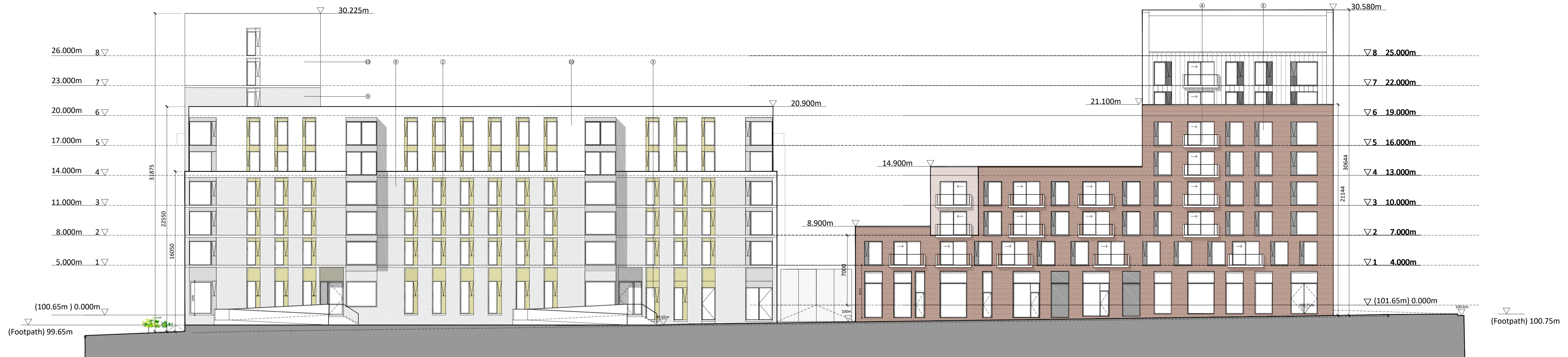
NORTH CONTEXTUAL ELEVATION SECTOR 2 & 3 - ELEVATION AA SCALE 1:200