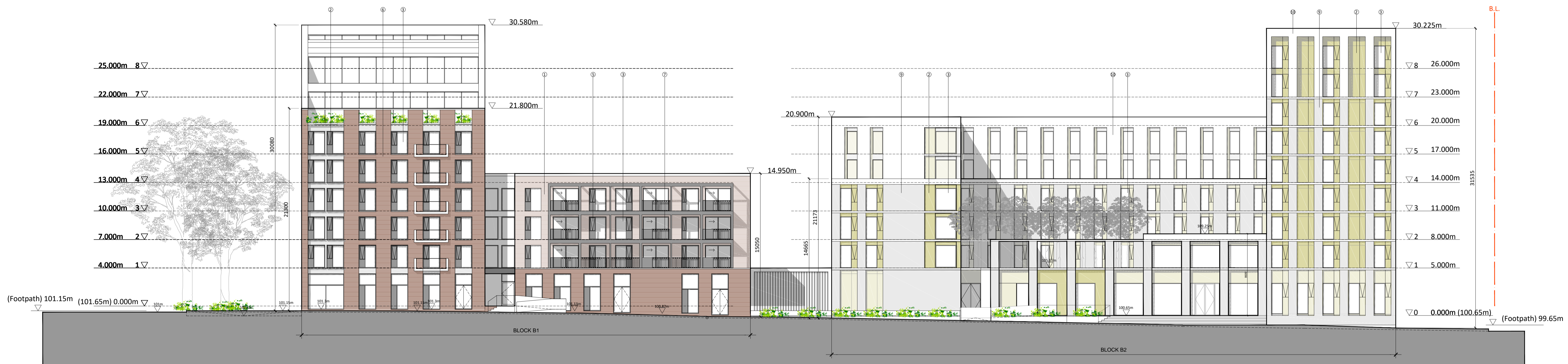
SOUTH CONTEXTUAL ELEVATION SECTOR 2 & 3 - ELEVATION BB SCALE 1:200