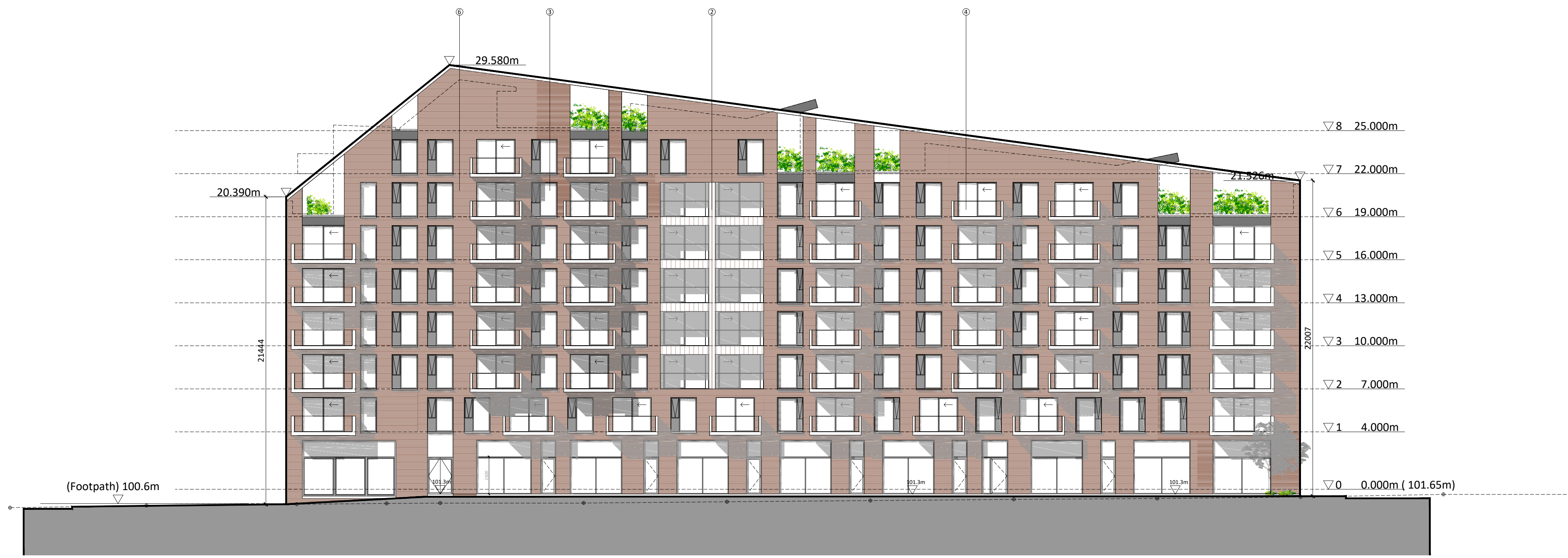
WEST ELEVATION SECTOR 2 - ELEVATION DD SCALE 1:200

SECTOR 2 & 3 CONTEXTUAL ELEVATIONS: EAST / CC + WEST / DD