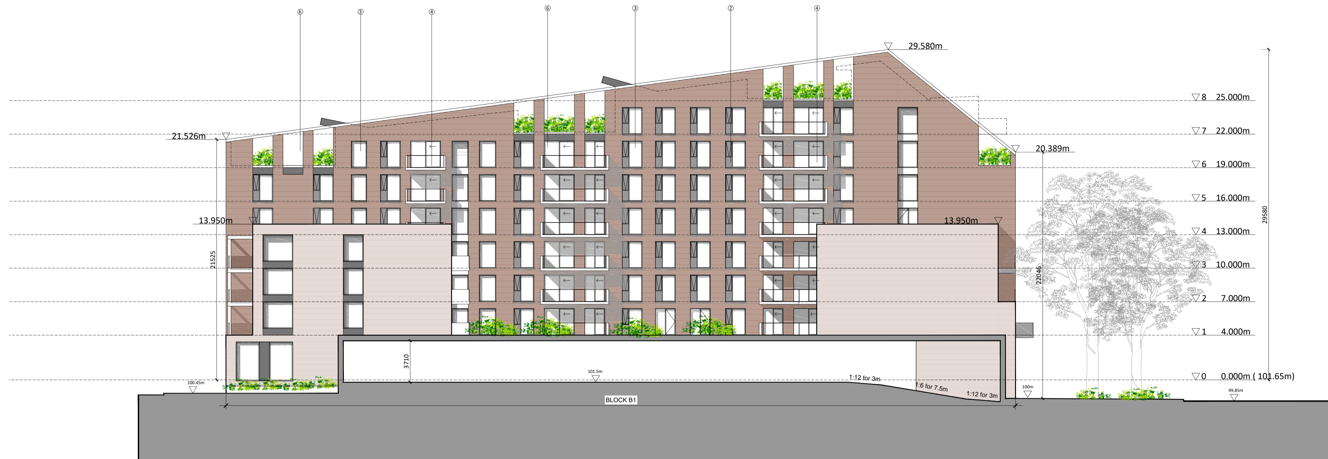
WEST ELEVATION SECTOR 2 - ELEVATION EE SCALE 1:200