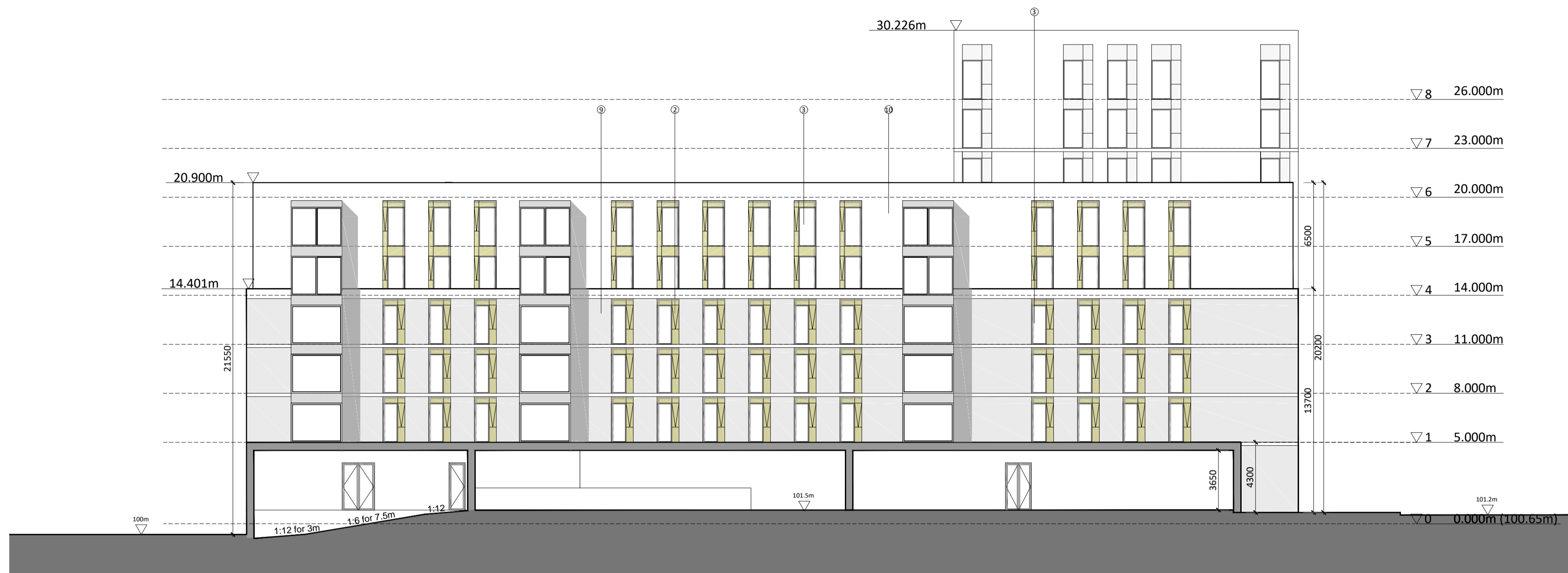
CONTEXTUAL ELEVATION SECTOR 2- ELEVATION FF SCALE 1:200