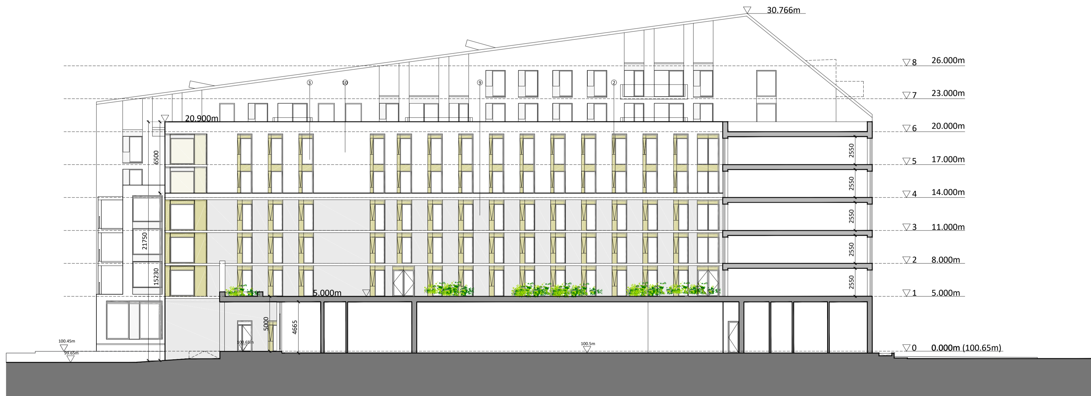
CONTEXTUAL ELEVATION SECTOR 2 - ELEVATION GG SCALE 1:200