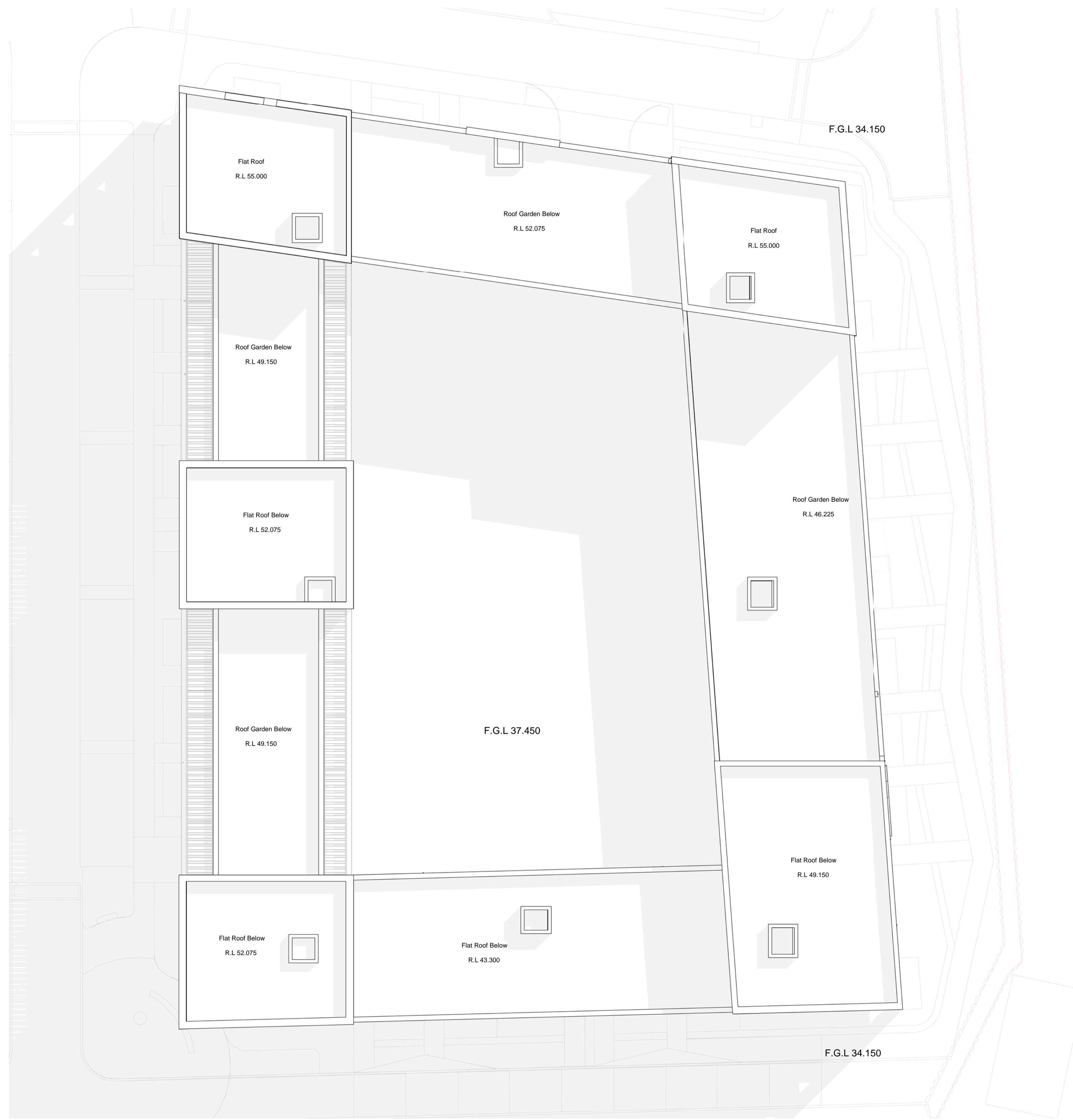
1 Roof Plan 1 : 200