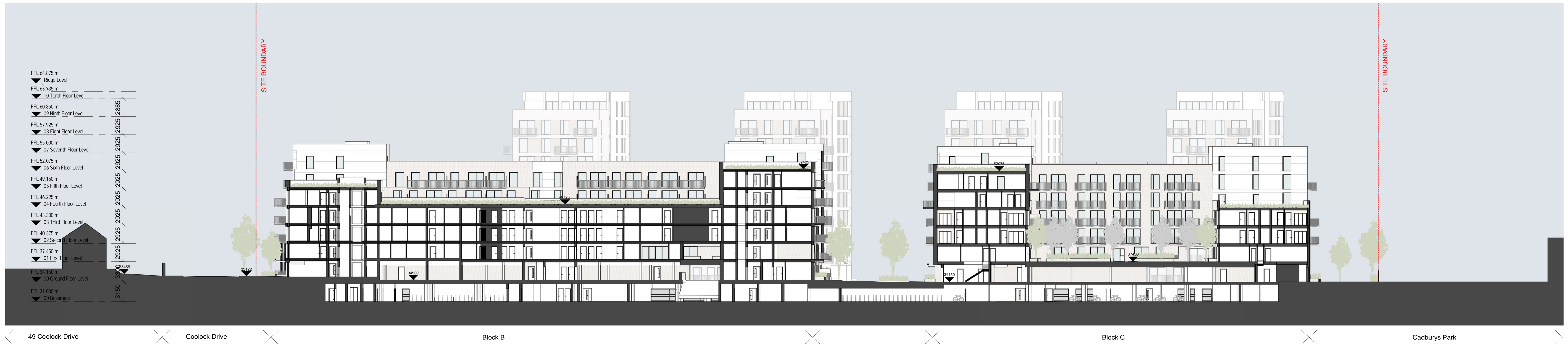
1 Section 1 1 : 250