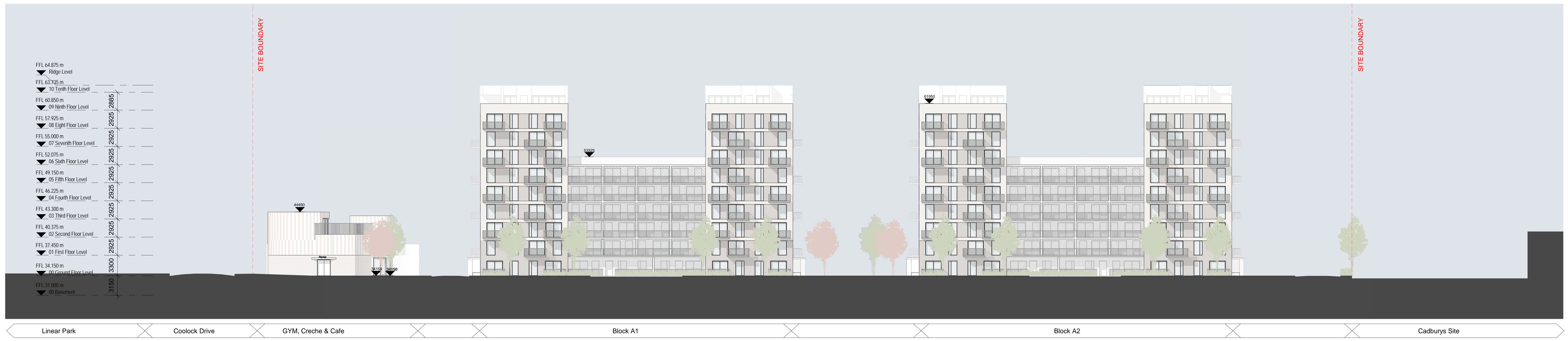
3 Section 3 1 : 250