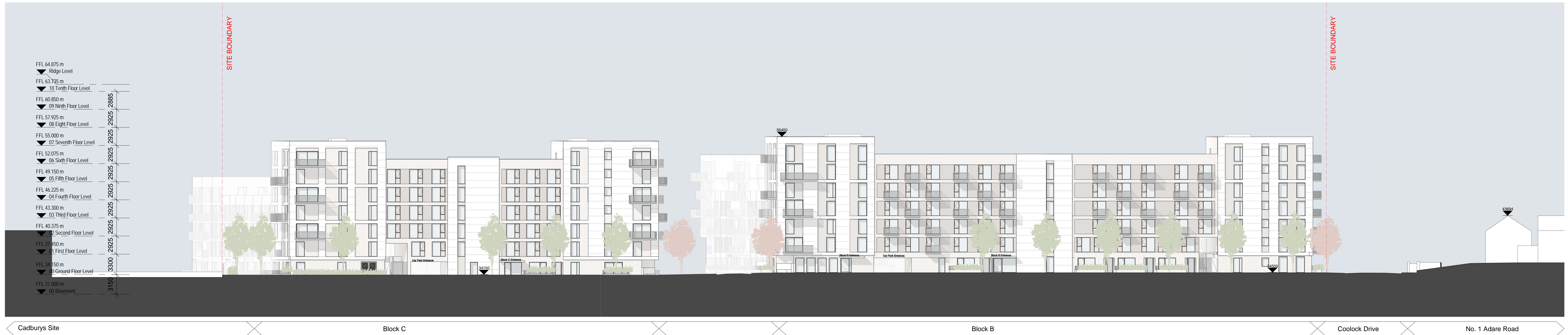
2 Section 2 1 : 250