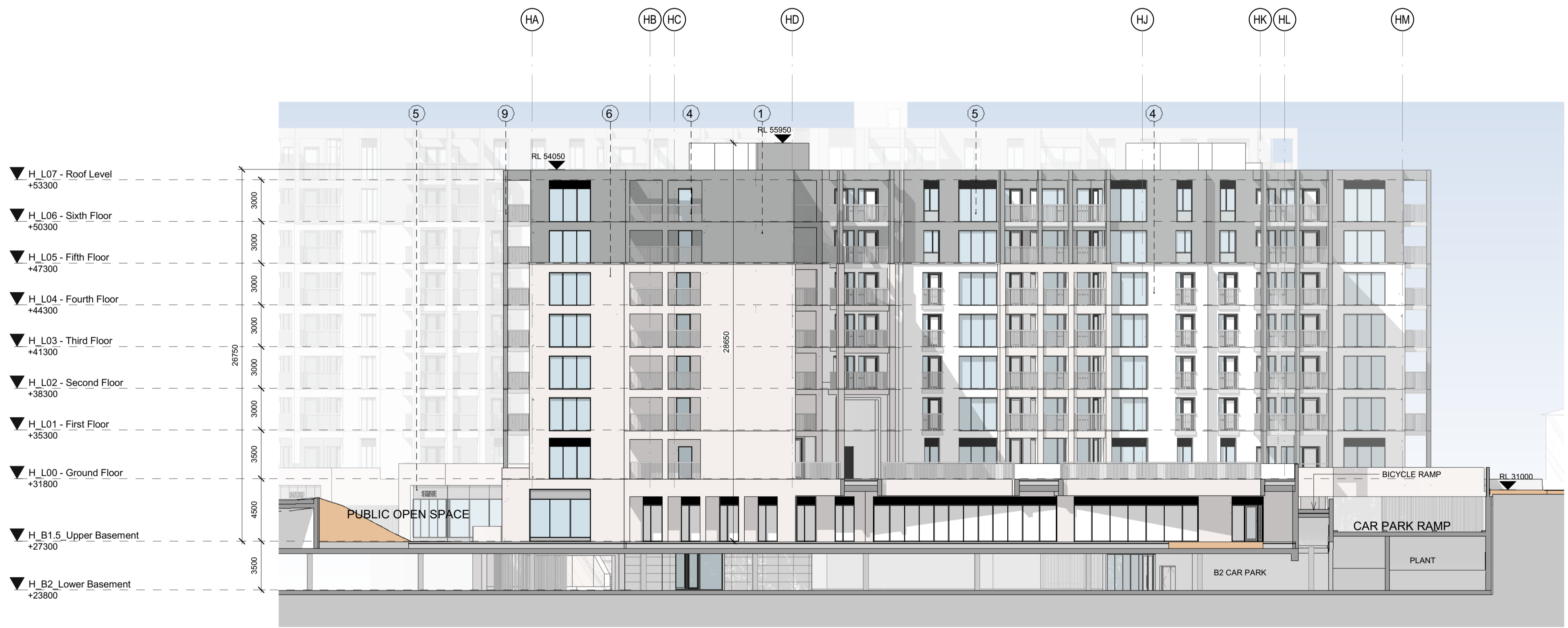
2 Block H_South Elevation_Planning 1 : 200