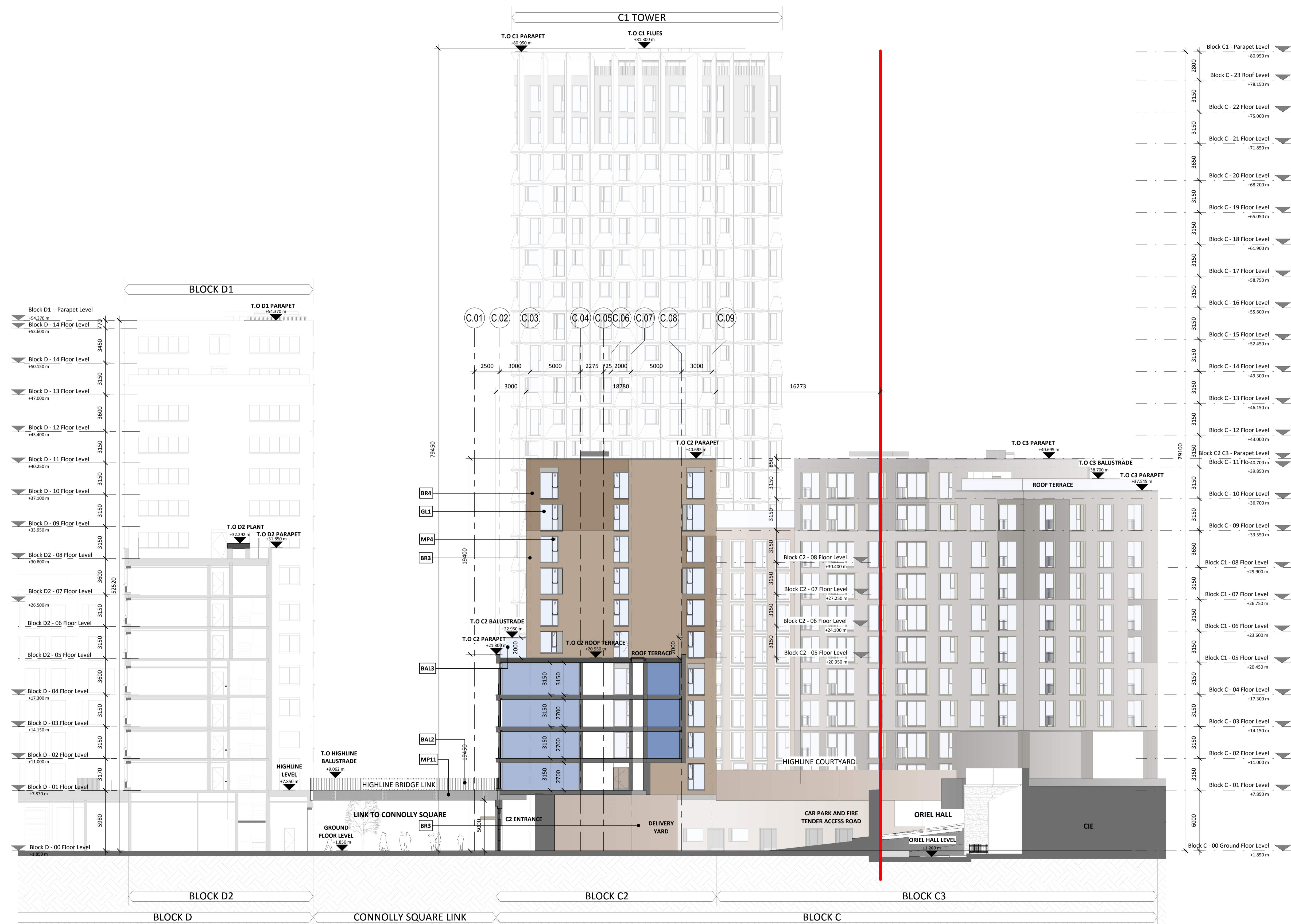
E-E BLOCK C - SECTION E-E 1 : 200