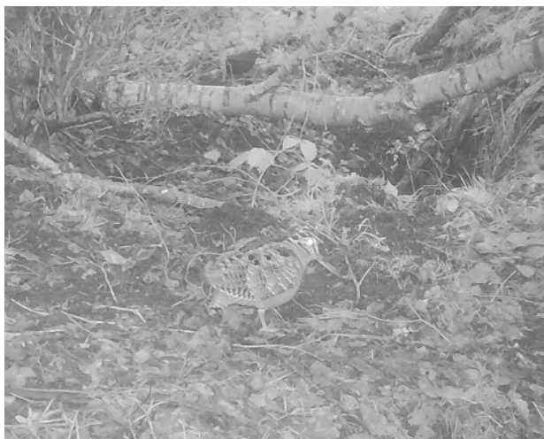
Plate 22. Woodcock ( Scolopax rusticola ) camera location 1.