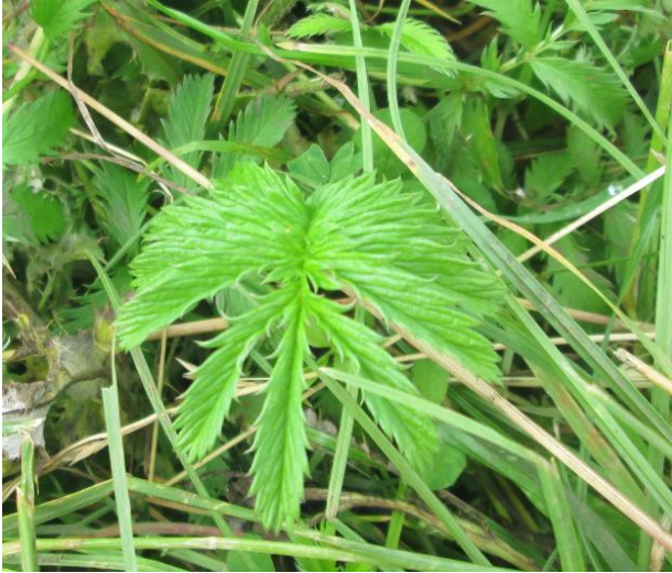
Plate 5. Silverweed ( Potentilla anserina ) close to a drainage ditch (not to scale).