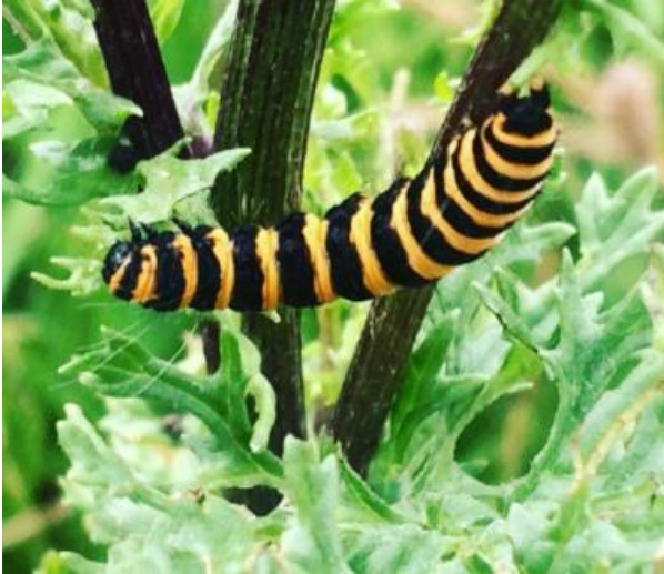
Plate 29. Caterpillar of Cinnabar moth ( Tyria jacobaeae ) on food plant Ragwort (not to scale).