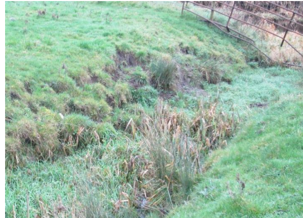
Plate 14. Drainage ditch discharging directly in to the Figle River south of the proposed cable route.