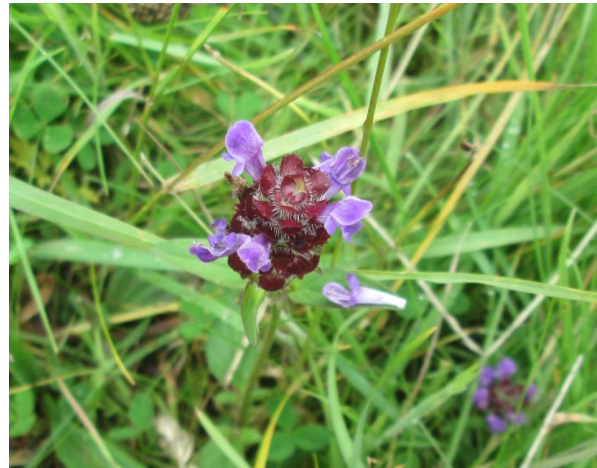
Plate 2. Self-heal ( Prunella vulgaris ) in a field of an Improved agricultural grassland (not to scale).