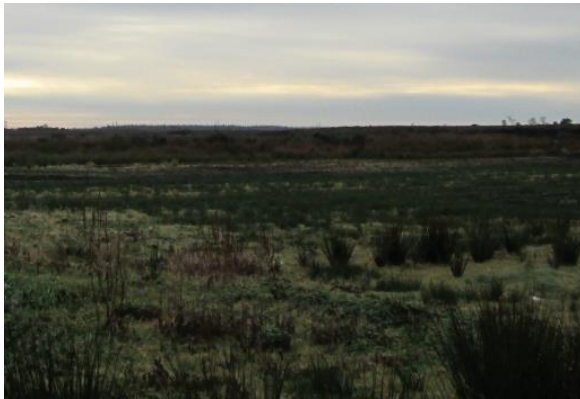
Plate 15. Rushy part of field leading towards cut over bog to the southwest of the proposed development.