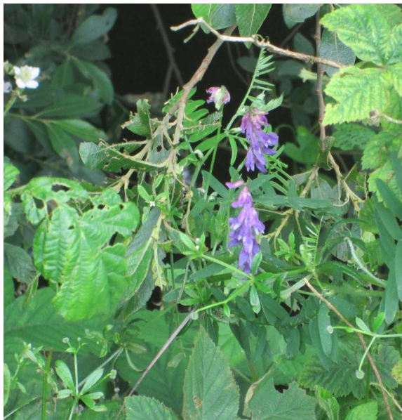
Plate 3. Vetch sp. ( Vicia spp. ) with Bramble ( Rubus fruticosus ) and Cleavers ( Galium aparine ) (not to scale).