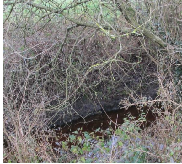
Plate 12. Drainage ditch along field boundary southeast of proposed substation.