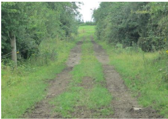
Plate 10. rough track leading south adjacent to Figile River.