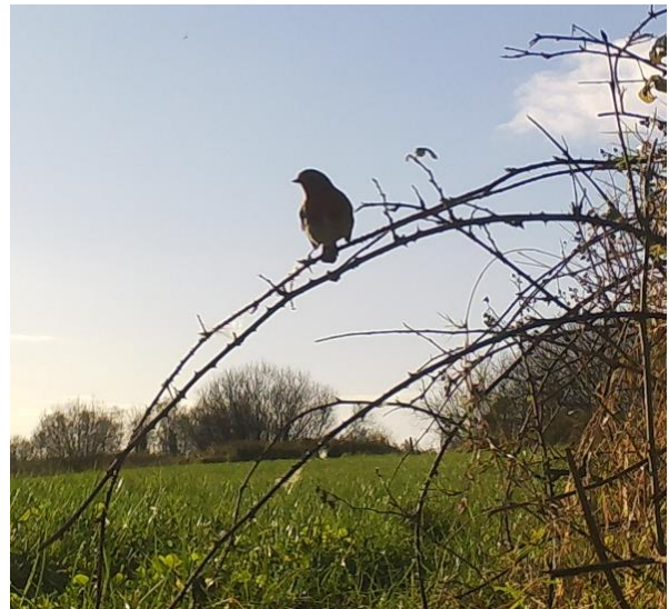
Plate 28. Robin perched on Bramble camera location 2.