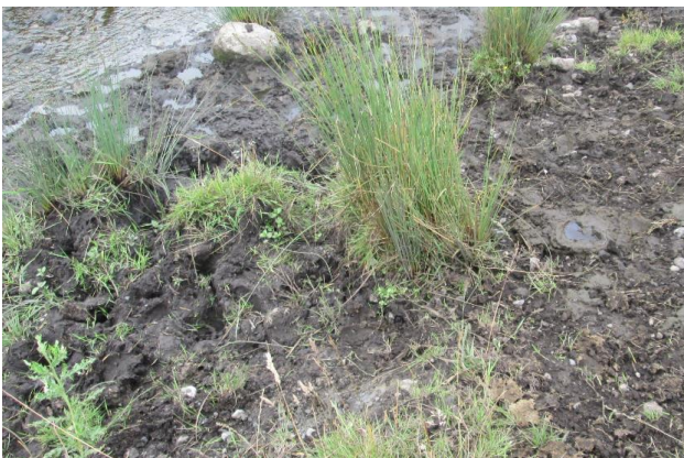
Plate 9. Poaching of the soil beside drainage ditch south of proposed substation.