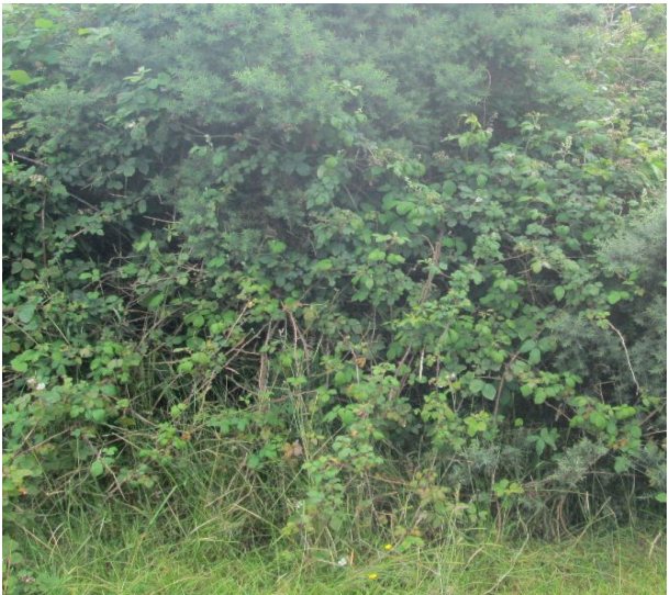
Plate 7. Hedgerows and scrub with Hawthorn ( Crataegus monogyna ), Gorse ( Ulex europaeus ) and Brambles ( Rubus fruticosus ).