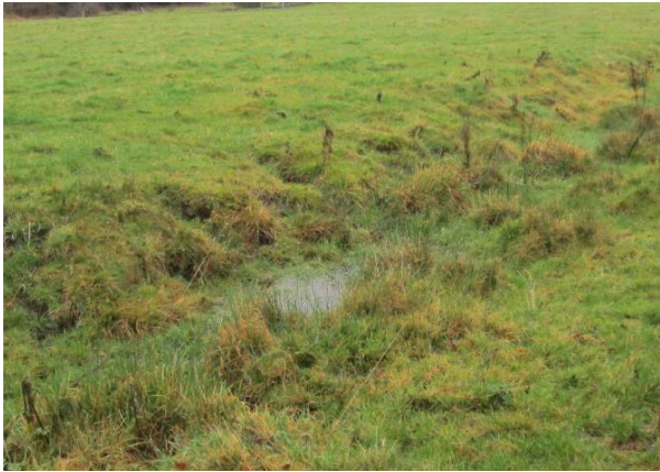
Plate 13. Drainage ditch east of proposed substation heading in a southerly direction.