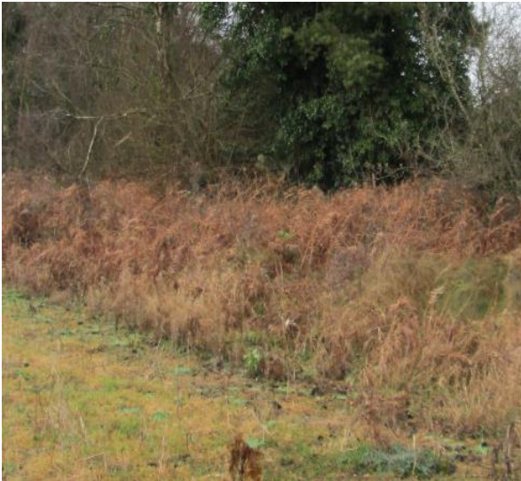
Plate 8. Bracken ( Pteridium aquilinum ) fringing a field of an Improved agricultural grassland.