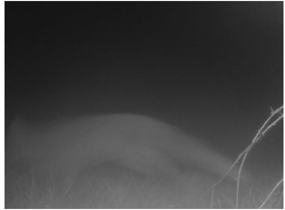
Plate 24. Fox exiting scrub camera location 2.