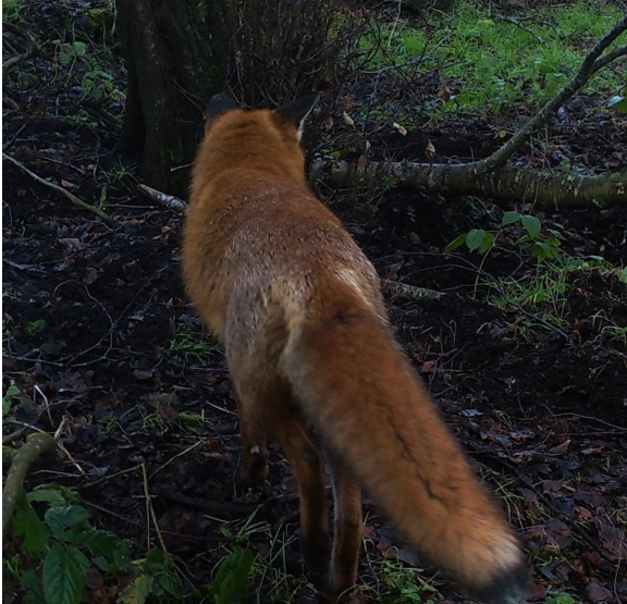
Plate 17. Fox ( Vulpes vulpes ) camera location 1.