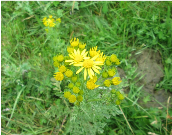
Plate 1. Ragwort ( Jacobaea vulgaris ) with cow dung present in a field of an Improved agricultural grassland (not to scale).