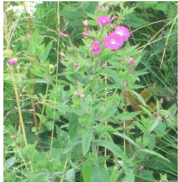
Plate 4. Great willowherb ( Epilobium hirsutum ) close to a drainage ditch (not to scale).