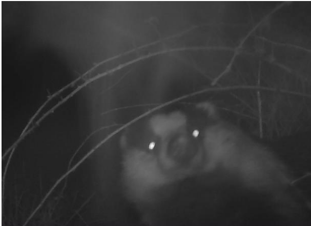
Plate 25. Badger exiting scrub camera location 2.