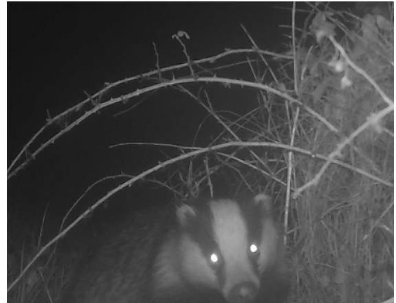
Plate 26. Badger about to enter scrub camera location 2.