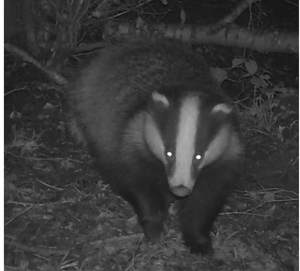
Plate 18. Badger ( Meles meles ) camera location 1.