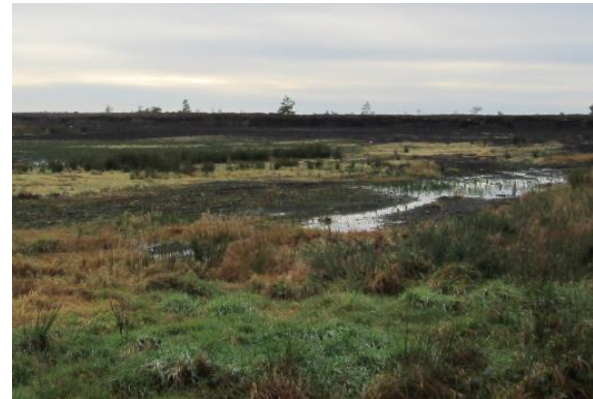
Plate 16. Rushy part of field with waterlogged parts leading towards cut over bog to the southwest of the proposed development.