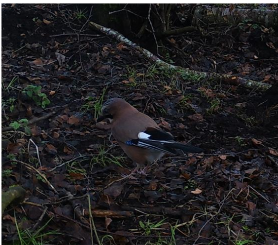
Plate 21. Jay ( Garrulus glandarius ) camera location 1.