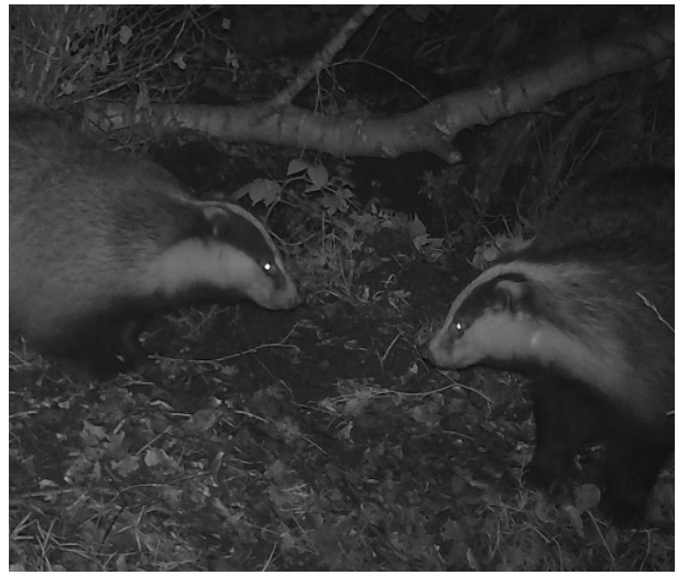
Plate 20. Badgers camera location 1.