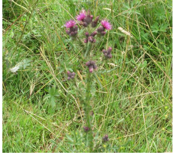
Plate 6. Thistle ( Cirsium spp. ) in a field of an Improved agricultural grassland (not to scale).