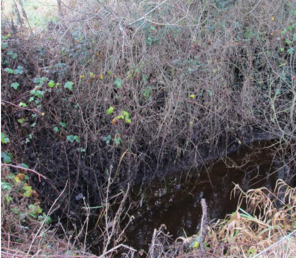
Plate 11. Drainage ditch along field boundary southeast of proposed substation.