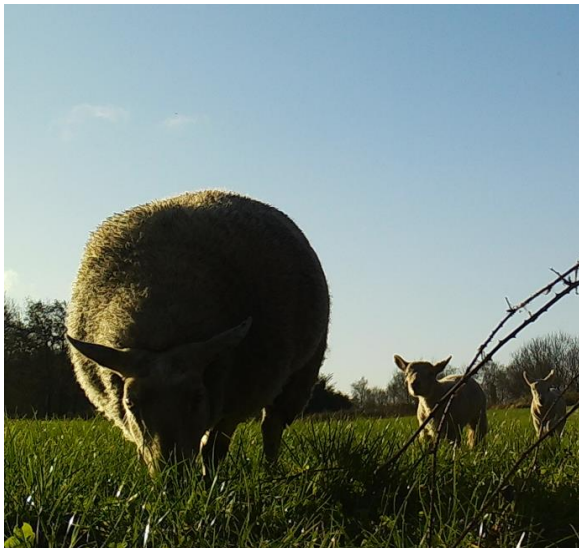
Plate 27. Ewe and lambs in field close to camera location 2.