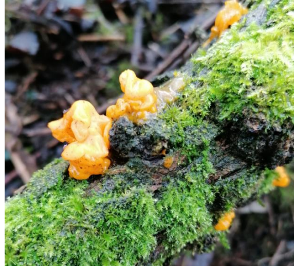
Plate 30. Yellow brain fungus ( Tremella mesenterica ) on a piece of rotting wood beneath a hedgerow (not to scale).