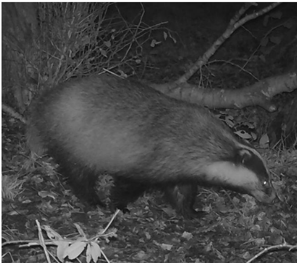
Plate 19. Badger camera location 1.