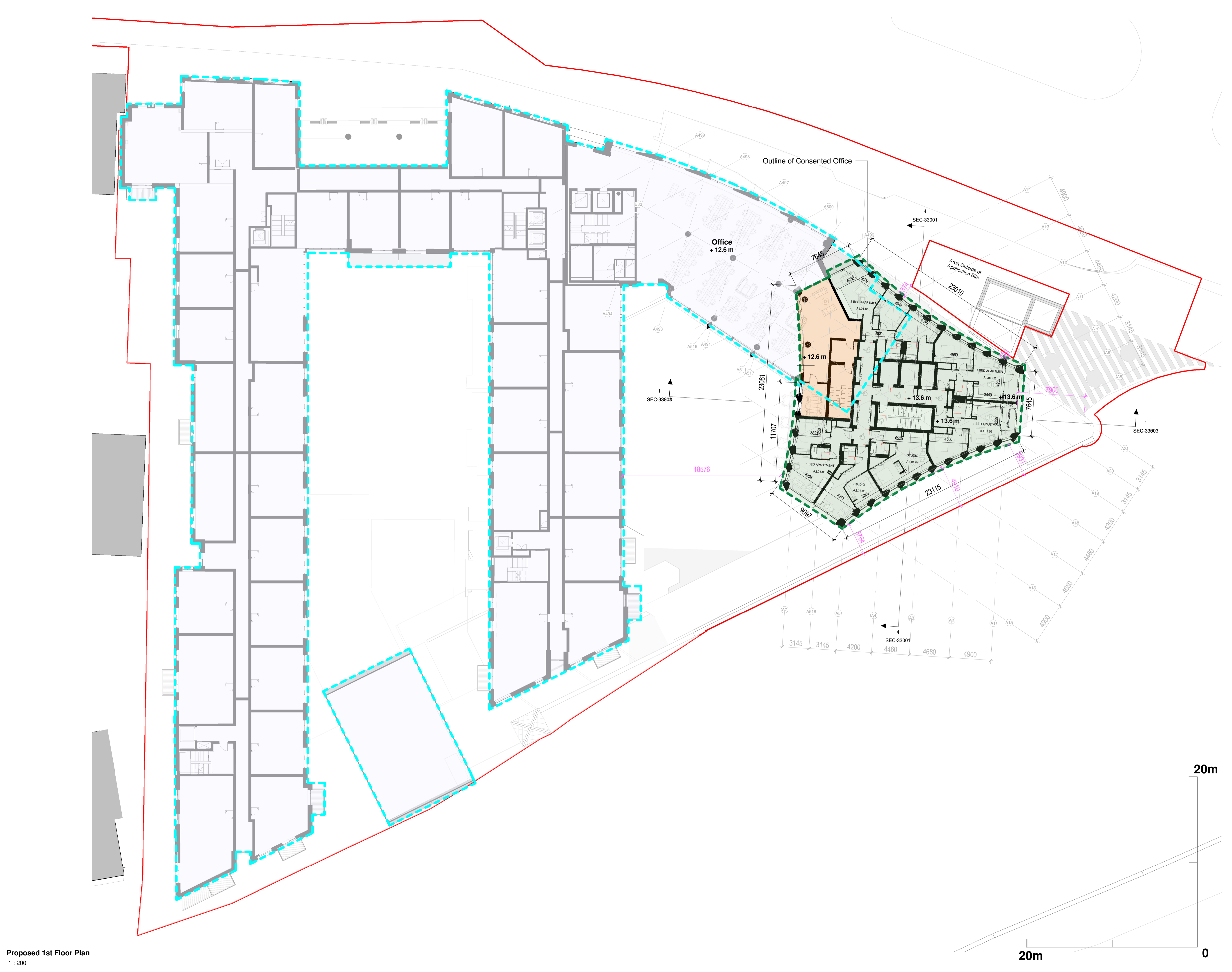
Proposed 1st Floor Plan 1 : 200