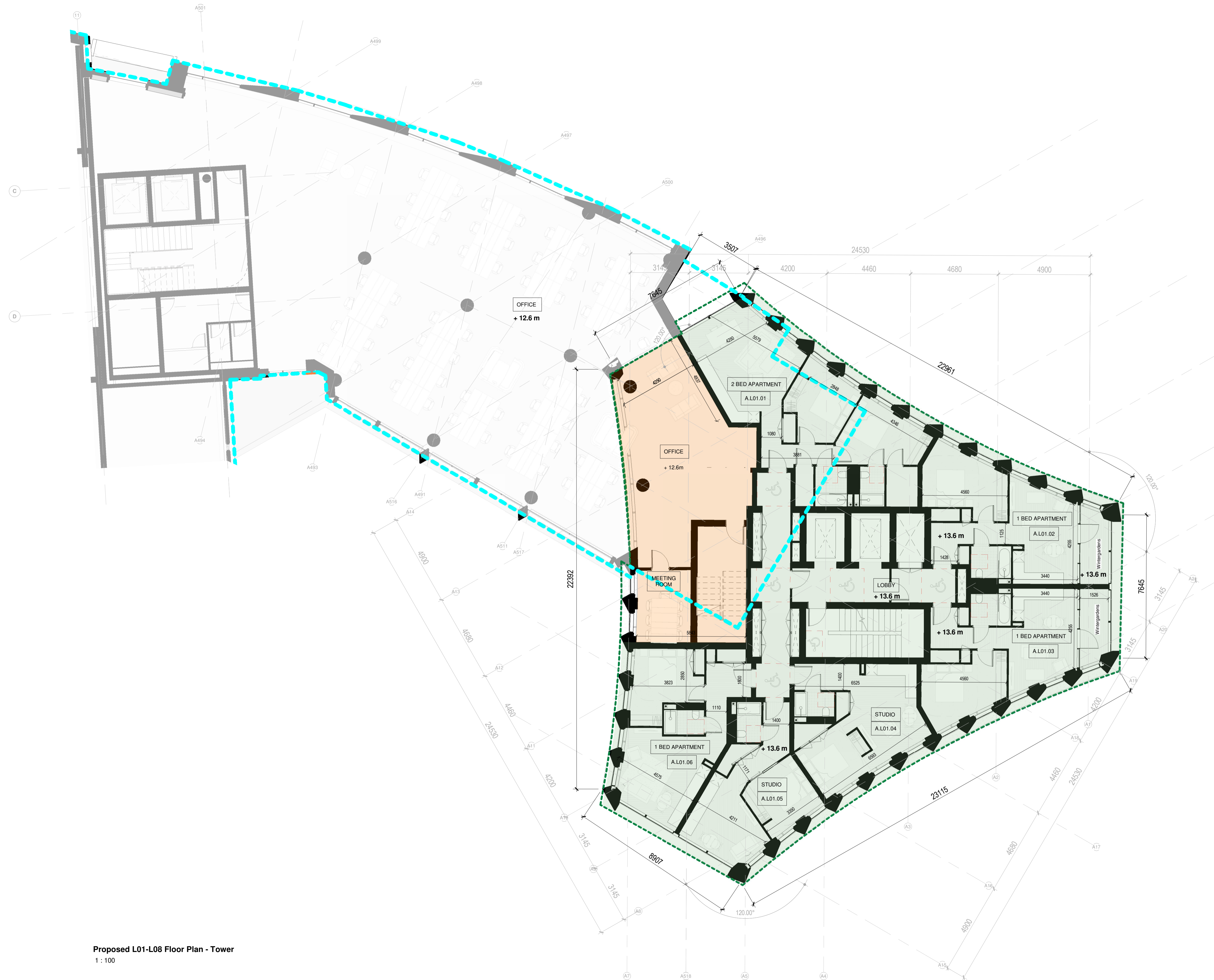
Proposed L01-L08 Floor Plan - Tower 1 : 100