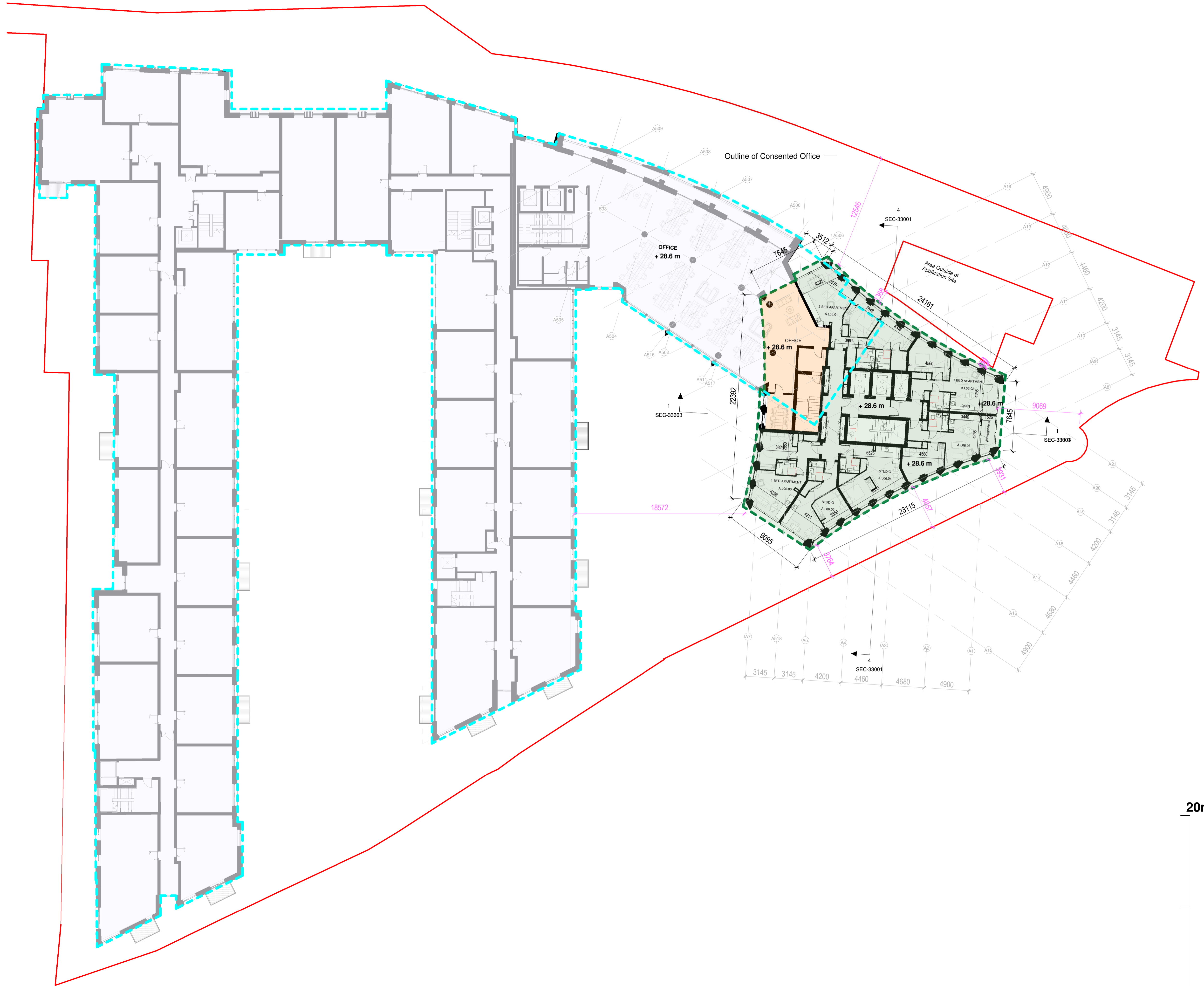
Proposed 4th - 6th Floor Plan 1 : 200