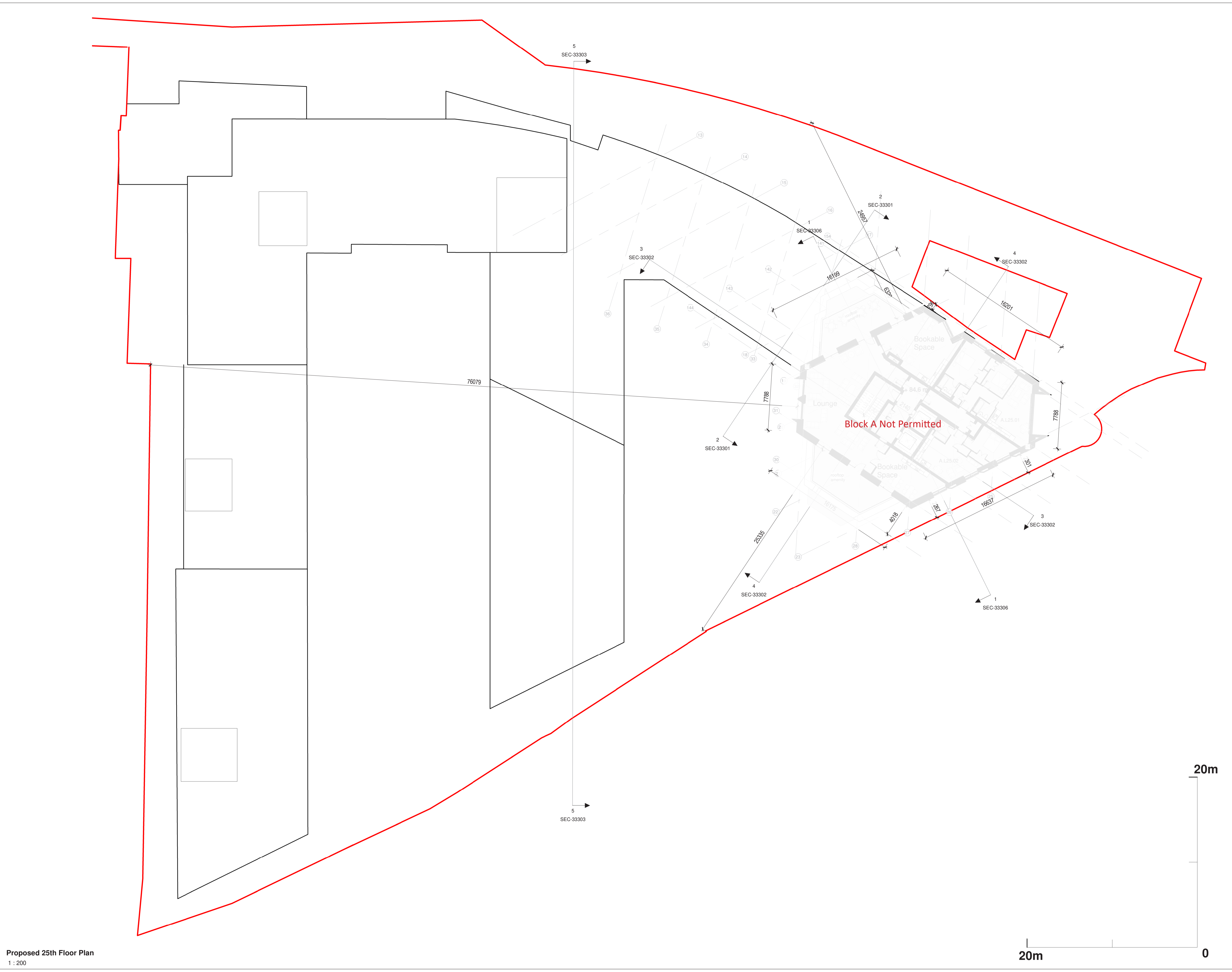
Proposed 25th Floor Plan 1 : 200