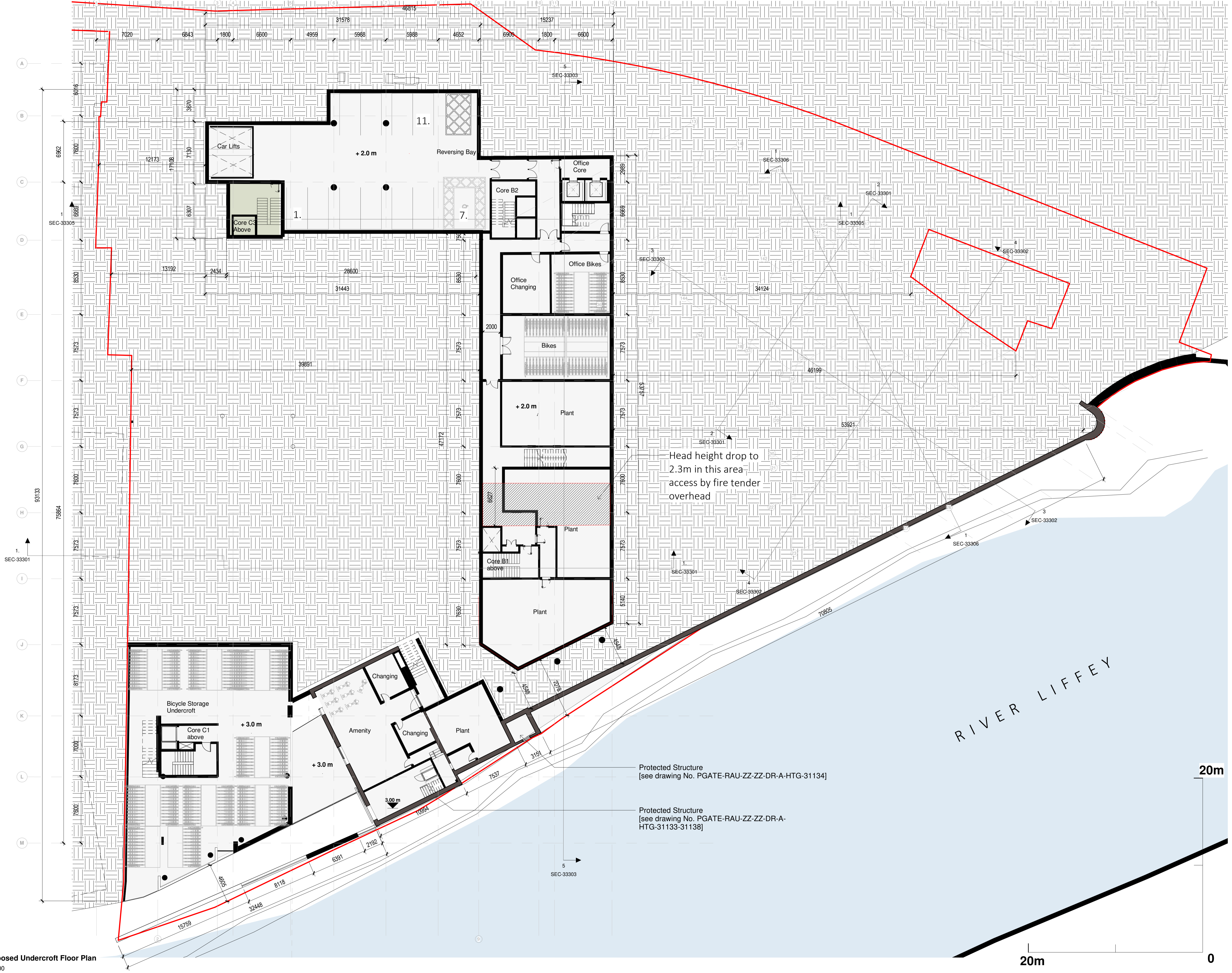
Proposed Undercroft Floor Plan 1 : 200