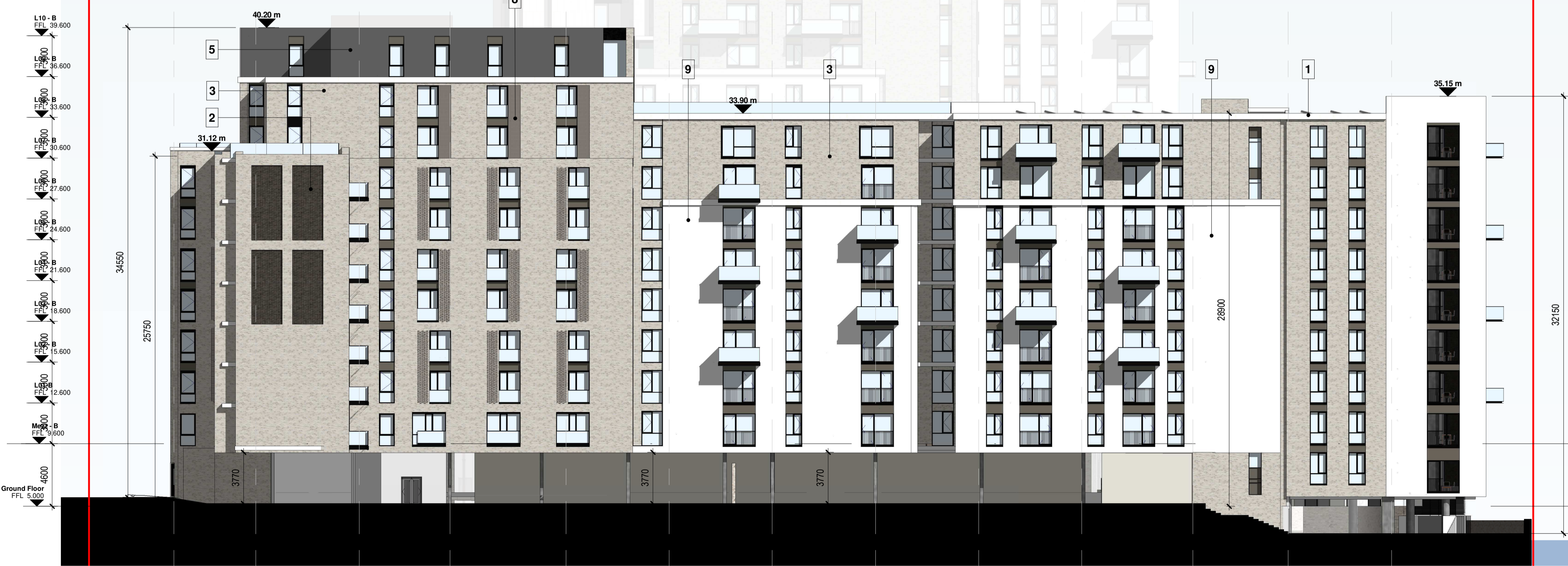
West Elevation 1 : 200

Notes: DO NOT SCALE FROM THIS DRAWING. USE FIGURED DIMENSIONS IN ALL CASES. VERIFY DIMENSIONS ON SITE AND REPORT ANY DISCREPANCIES TO THE ARCHITECTS IMMEDIATELY. THIS DRAWING TO BE READ IN CONJUNCTION WITH THE ARCHITECTS SPECIFICATION. © THIS DRAWING IS COPYRIGHT AND MAY ONLY BE REPRODUCED WITH THE ARCHITECTS PERMISSION.