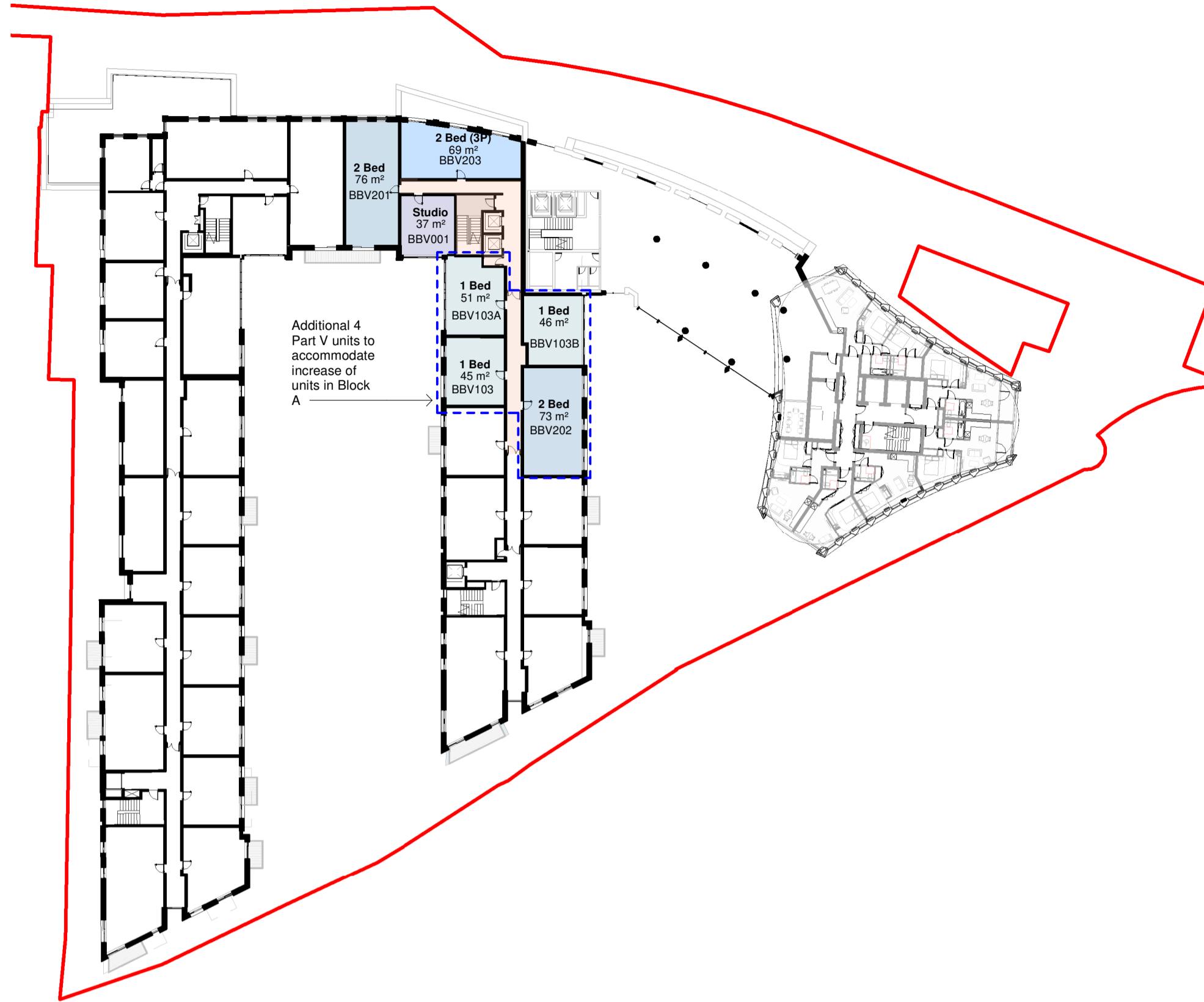
7th Floor Plan - Part V 1 : 500