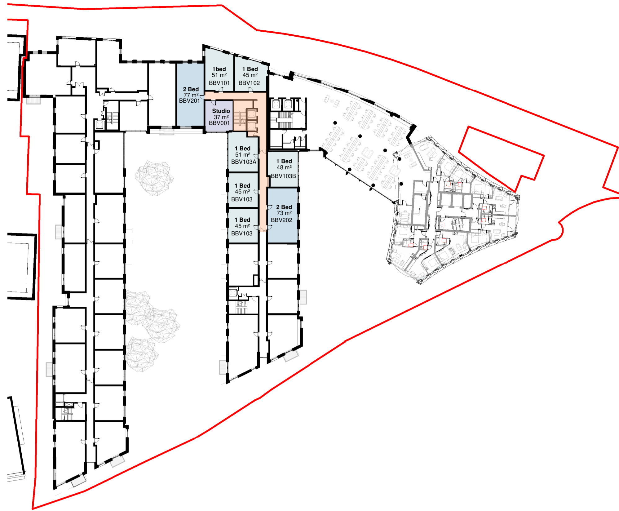
2nd - 6th Floor Plan - Part V 1 : 500