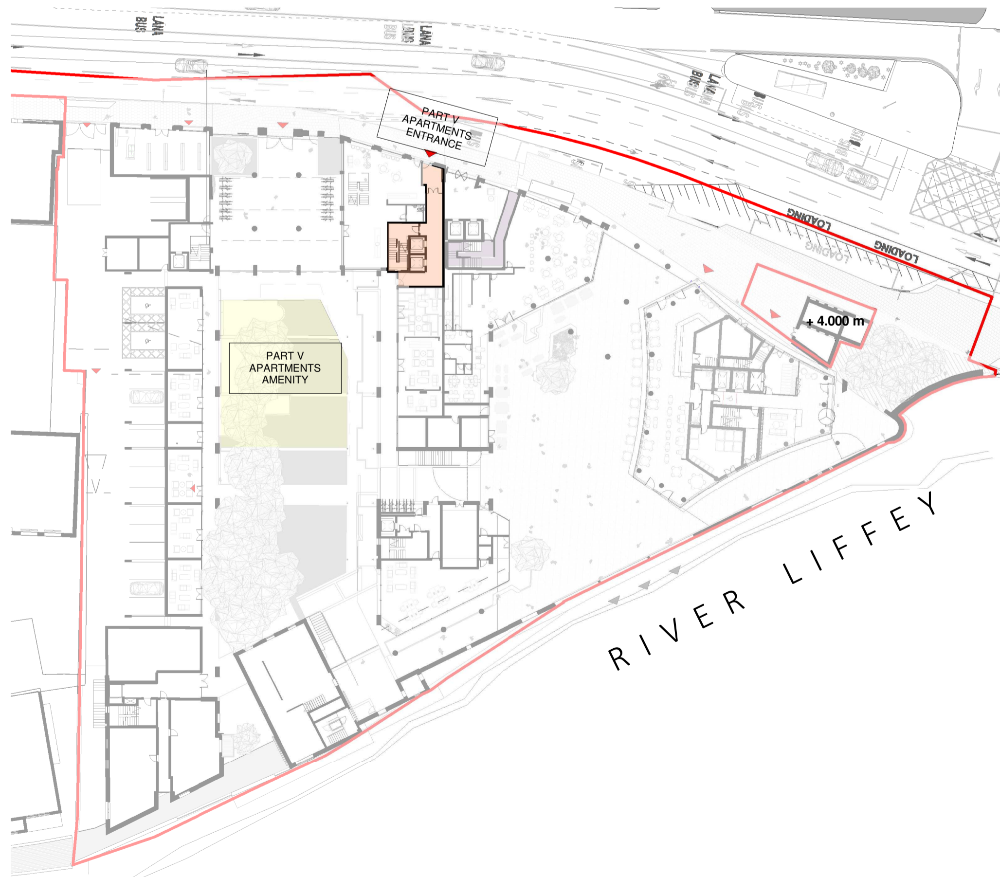
Ground Floor - Part V - Entrance 1 : 500