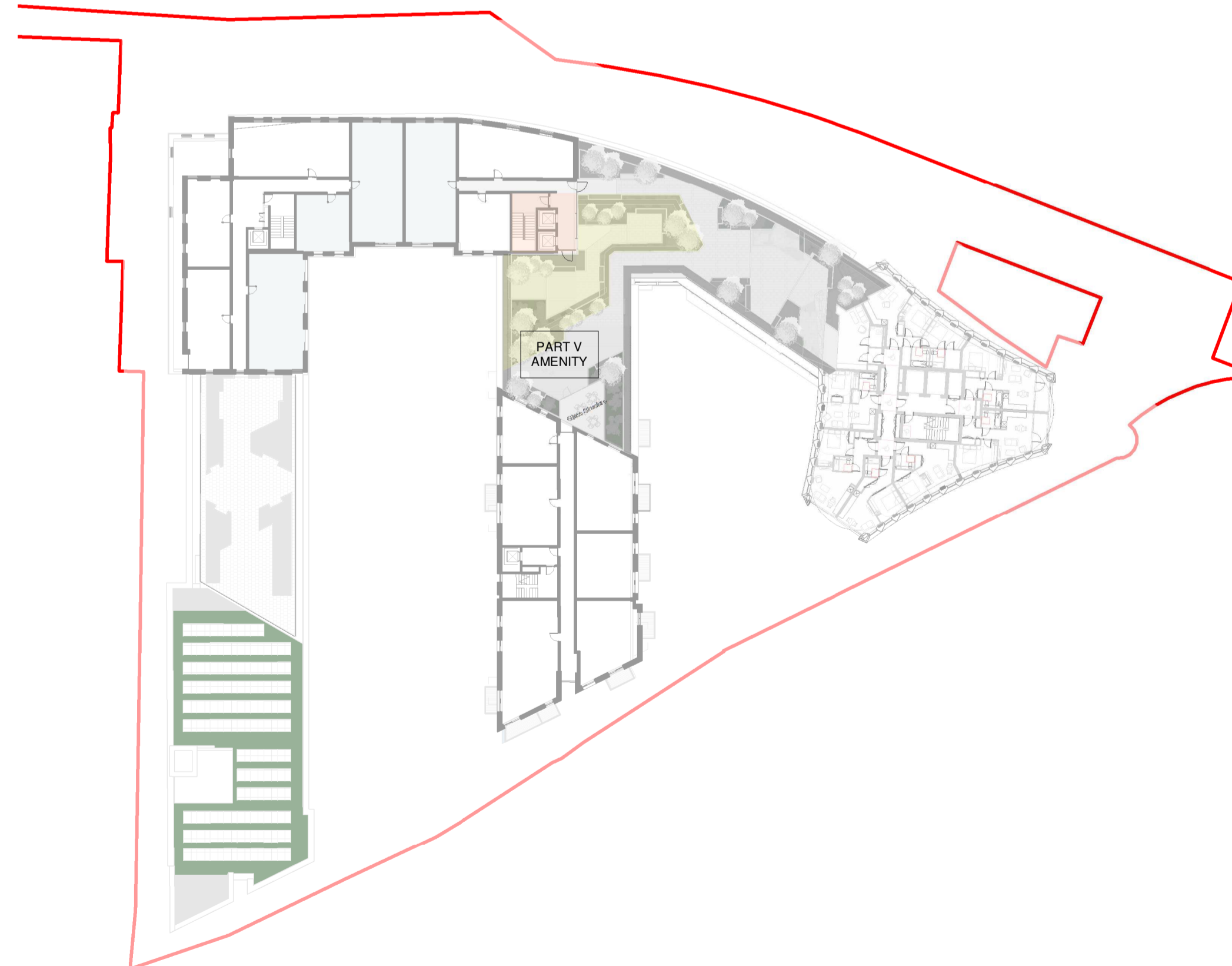
9th Floor Plan - Part V 1 : 500