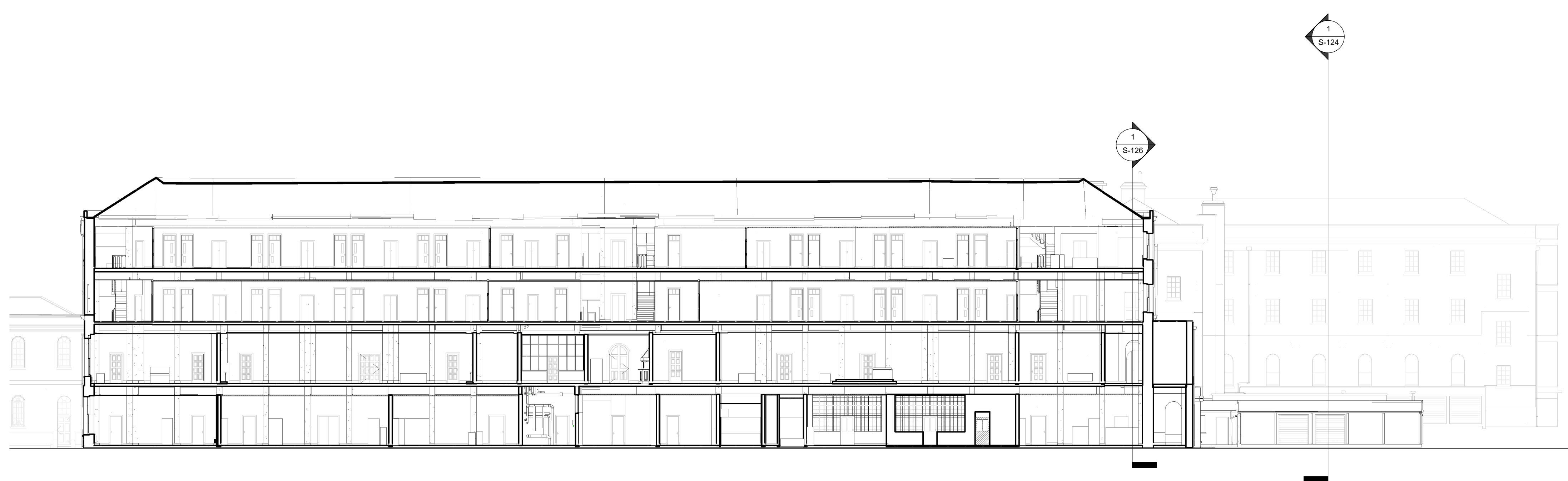
1 Seminary Building - Section-AA-Survey Scale - 1:200