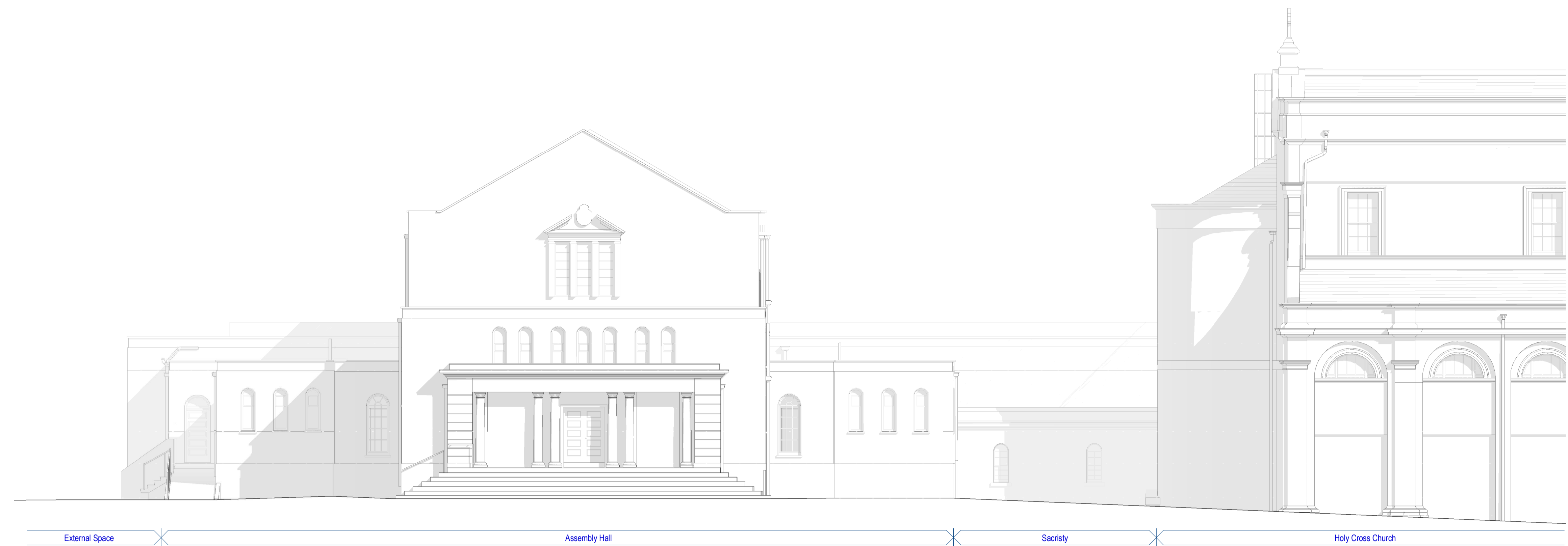
1 South Elevation-Survey Scale - 1 : 100