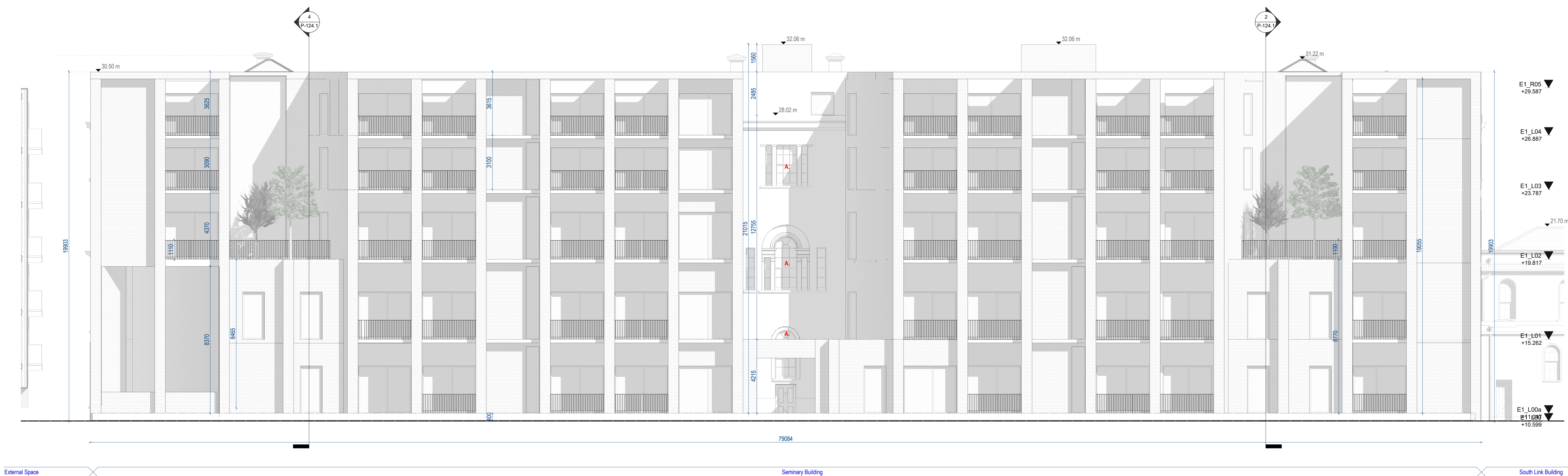
1 West Elevation-Planning Scale: 1:100