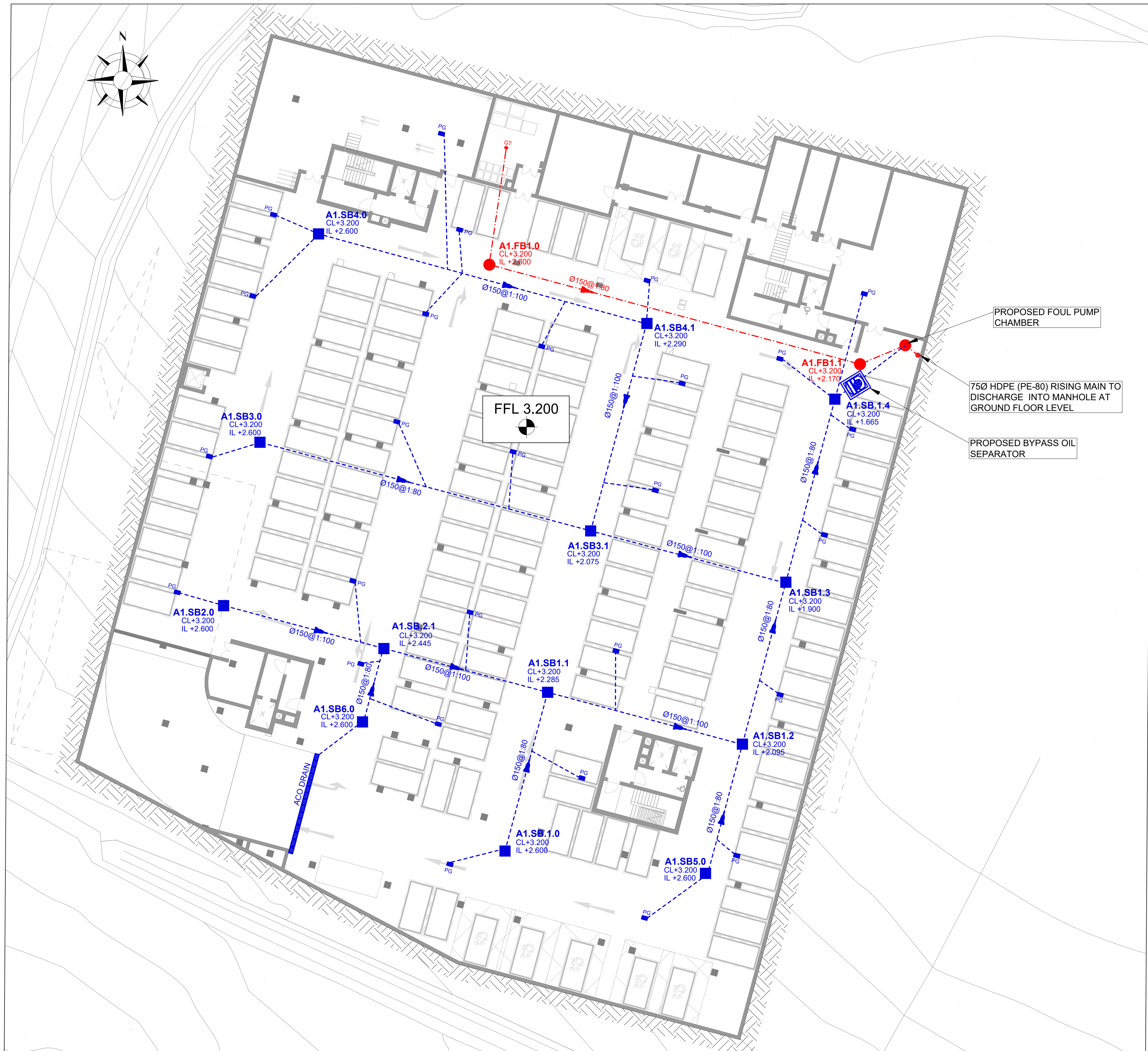
PROPOSED BLOCK A BASEMENT DRAINAGE PLAN SCALE @ A1: 1:200 SCALE @ A3: 1:100