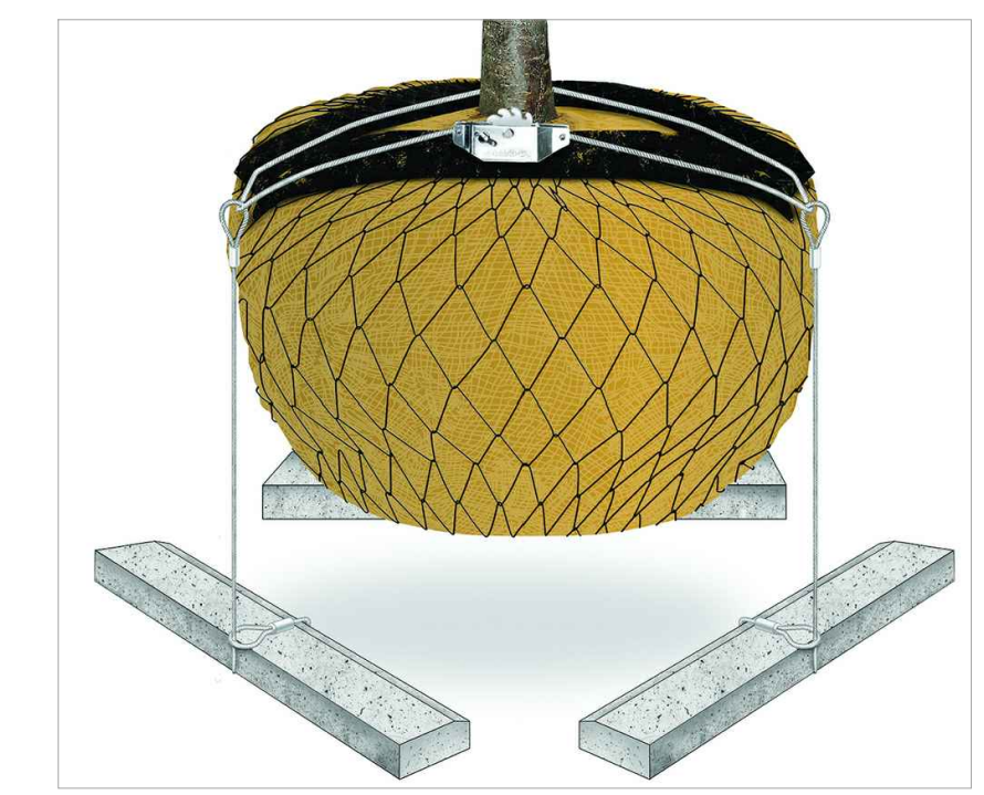
02 TREE ANCHOR SYSTEM