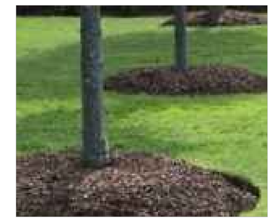
04 LAWN TREE PIT AND MULCH DETAIL

REFERENCE: THIS DRAWING IS NOT FOR CONSTRUCTION