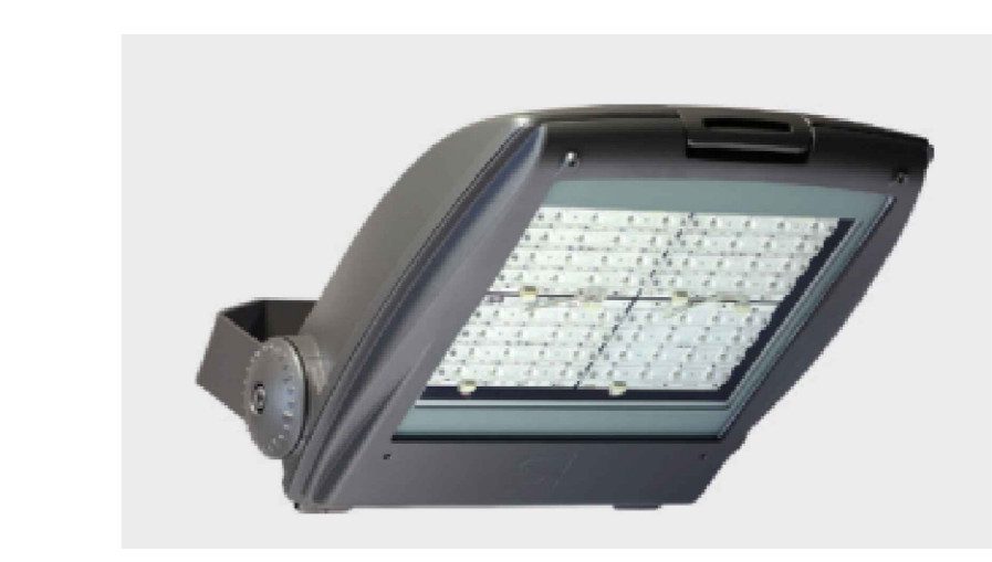
Exemplar Image of Floodlight