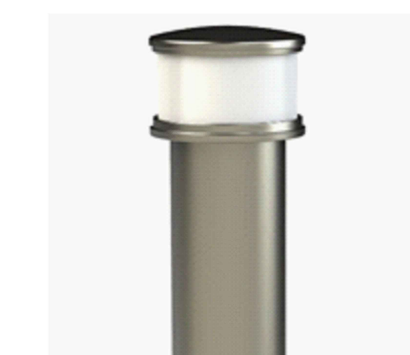
Exemplar Image of Bollard