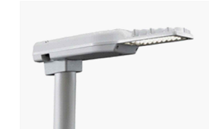
Exemplar Image of Lantern