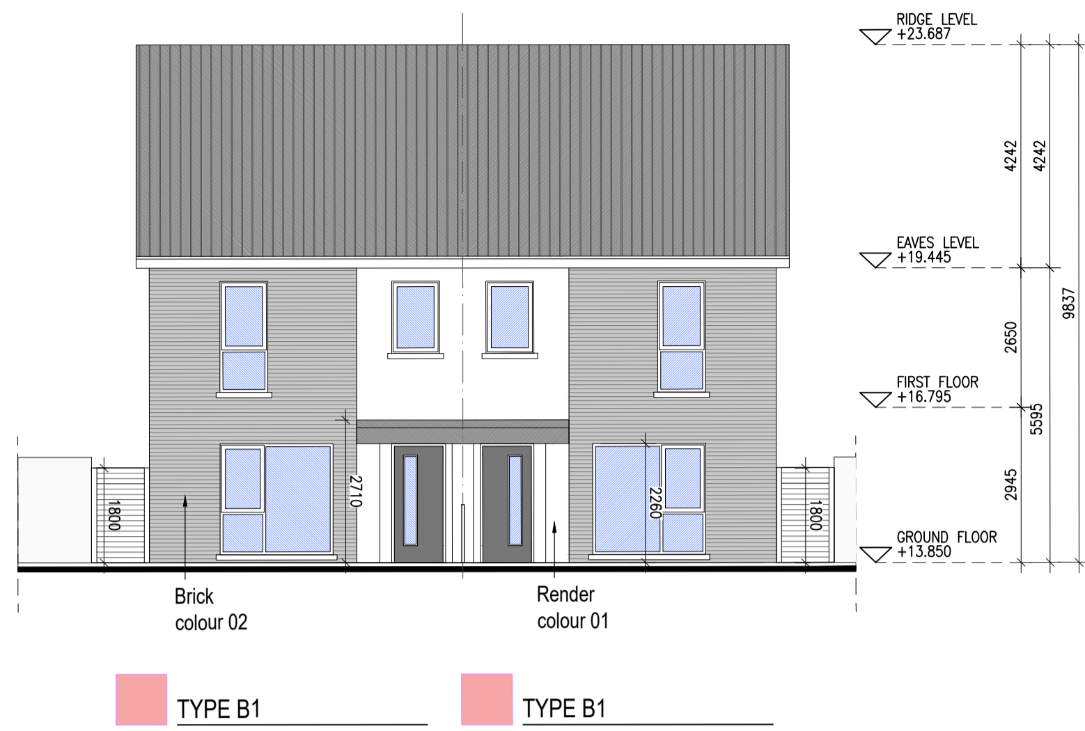
01 Type B1 - Front Elevations 1:100@A1 3 BED HOUSE