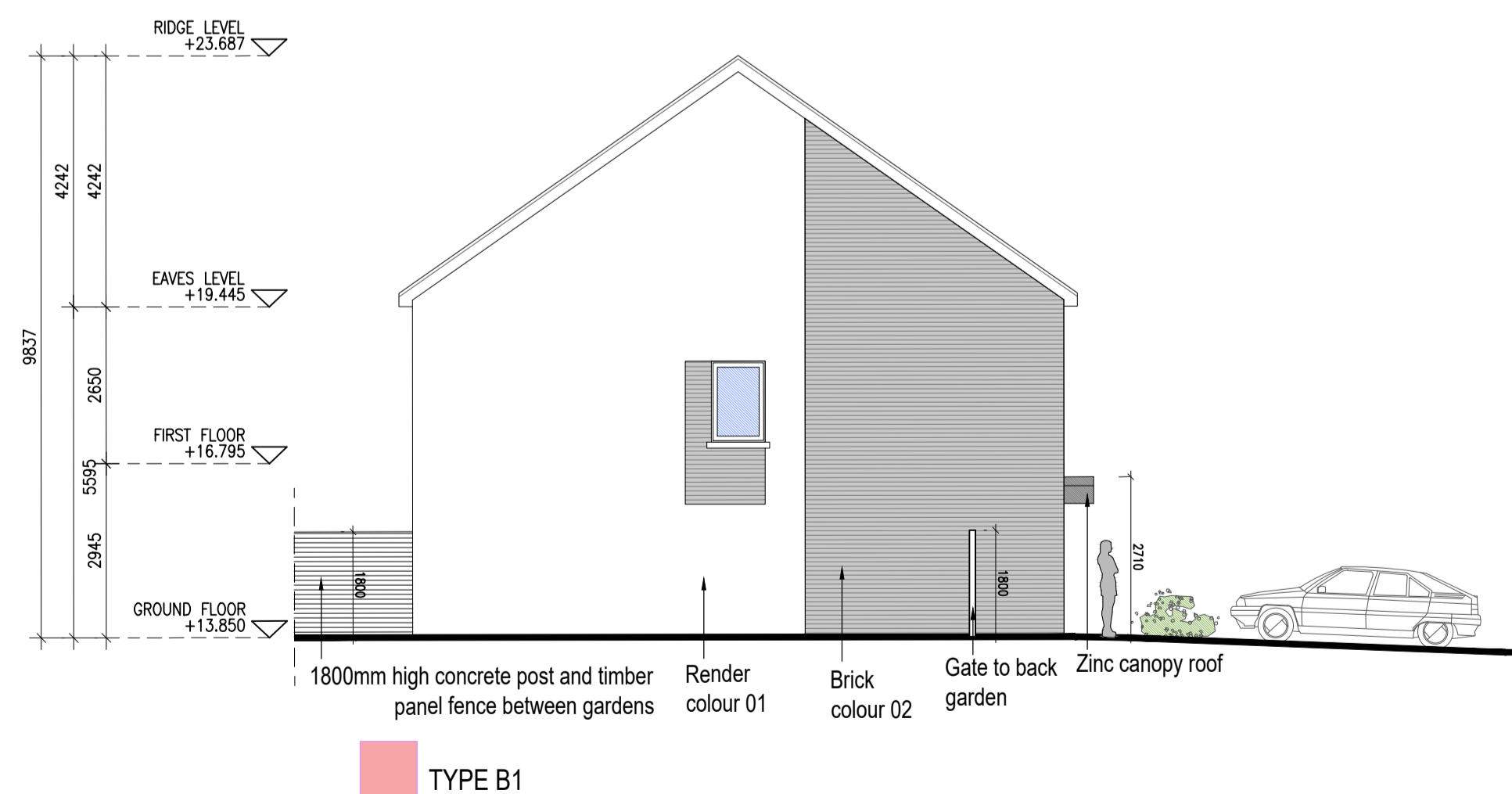
06 Type B1 - Side Elevation - Unit no. 48,49,50+51 1:100@A1 3 BED HOUSE