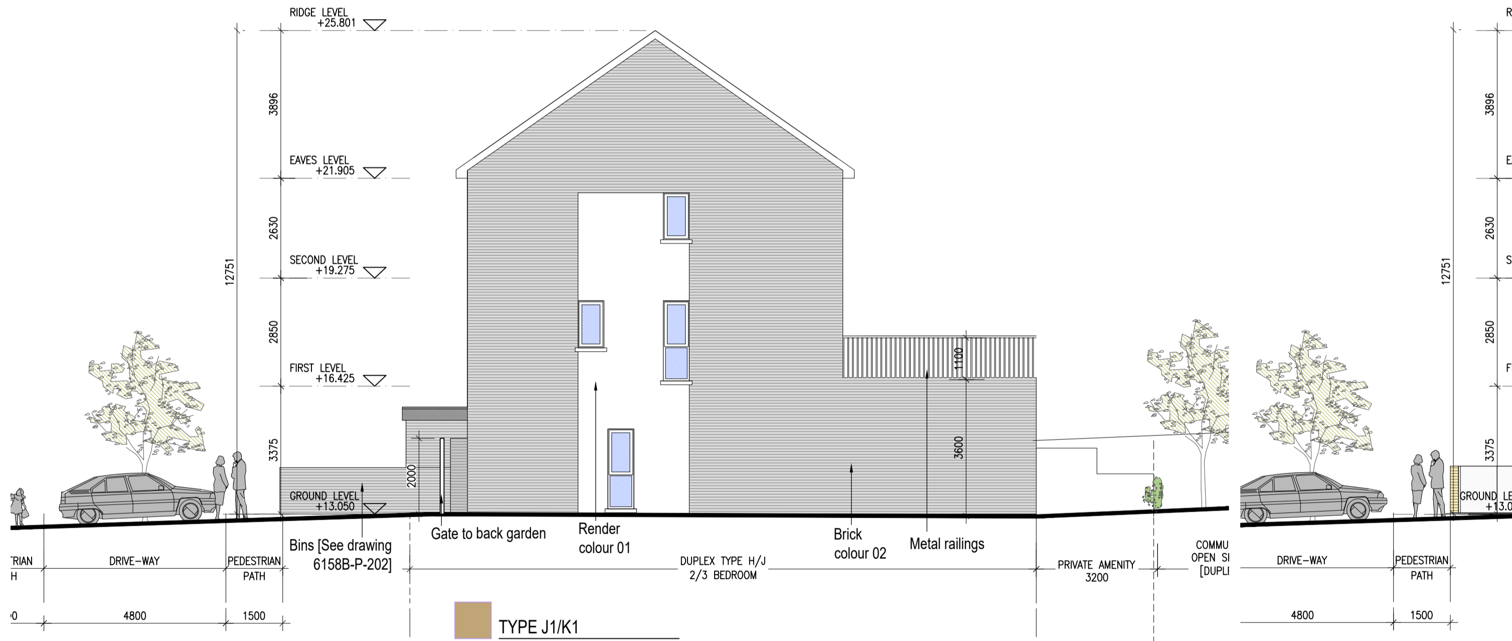
04 110 1:100@A1 DUPLIX ELEVATION 4- Side Elevation ( Block 03) 2 & 3 BED DUPLEX UNIT