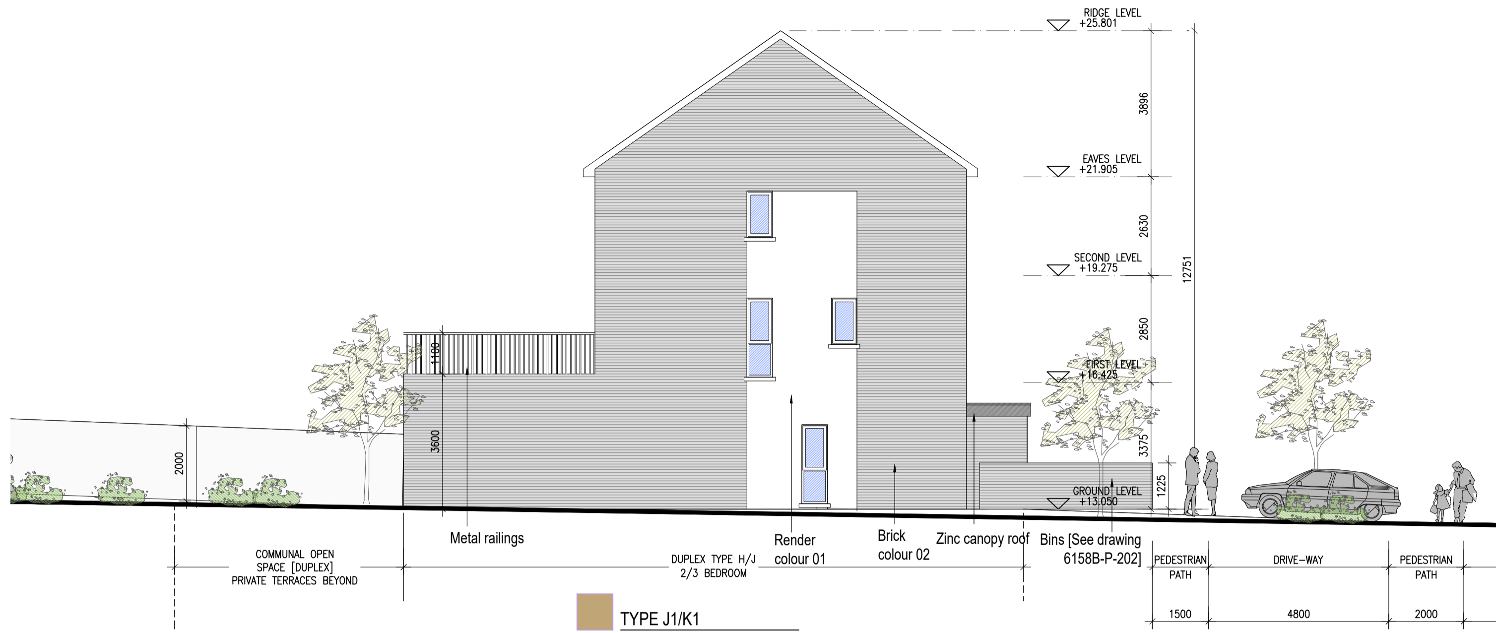
03 110 1:100@A1 DUPLIX ELEVATION 3- Side Elevation ( Block 03) 2 & 3 BED DUPLEX UNIT