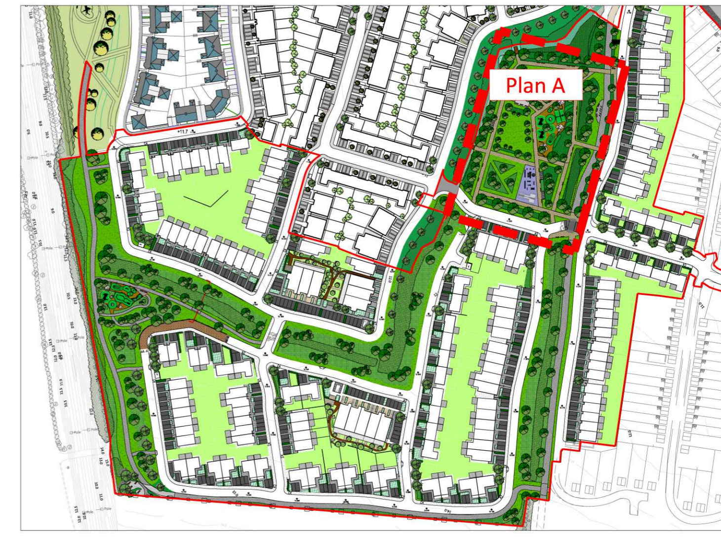
Location Plan - N.T.S