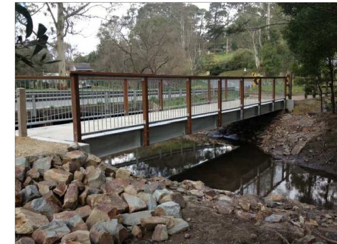
Steel Beam Pedestrian Footbridge