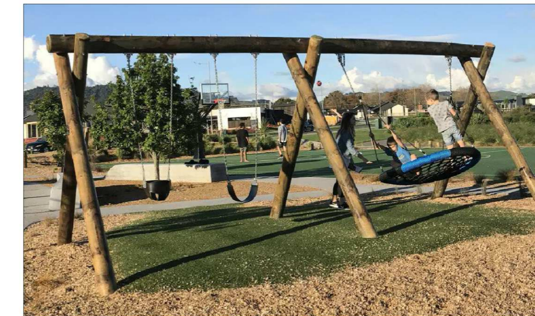
Basket Swing Combo (Creative Play or similar)