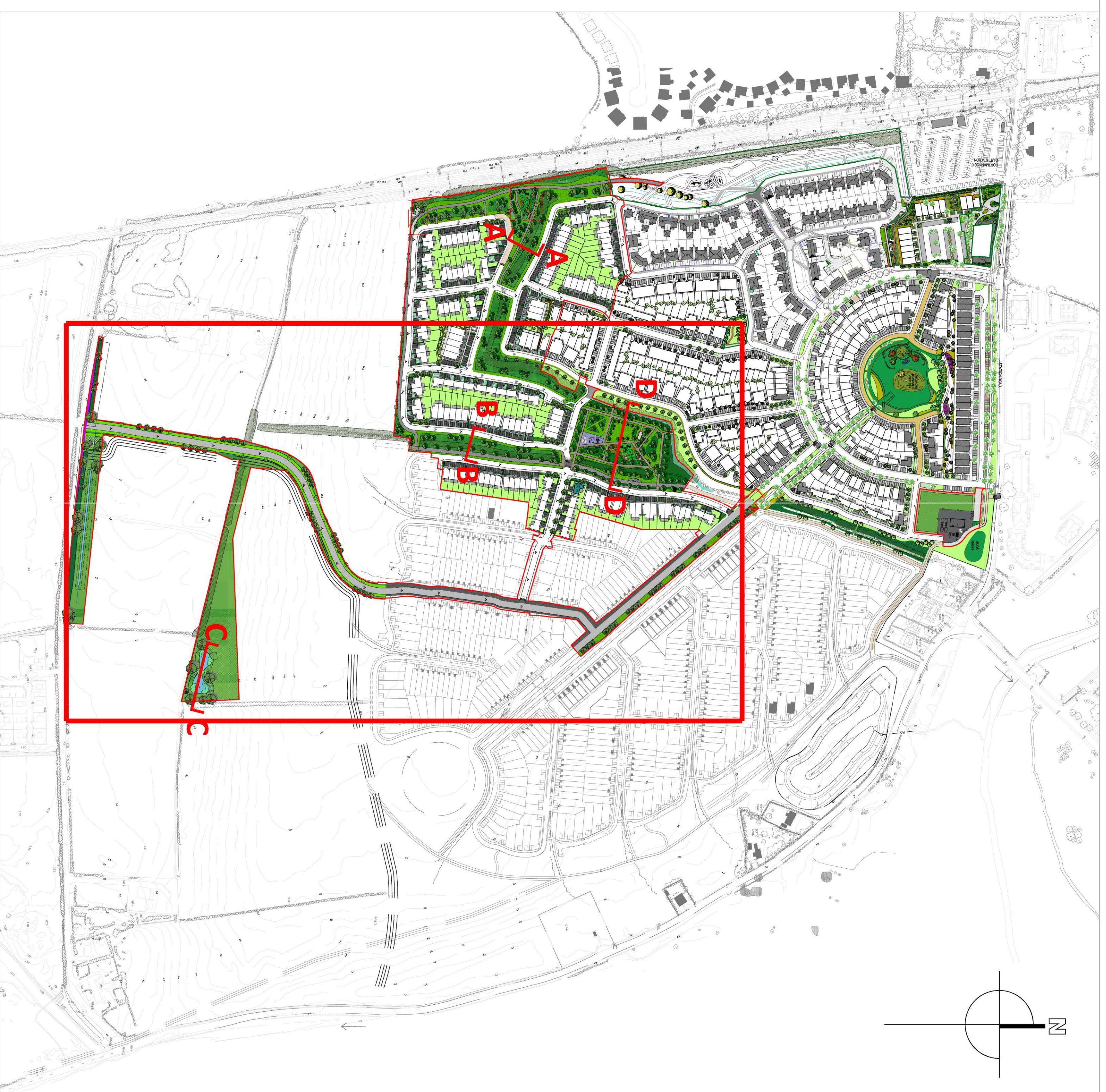
Location Plan N.I.T.S.