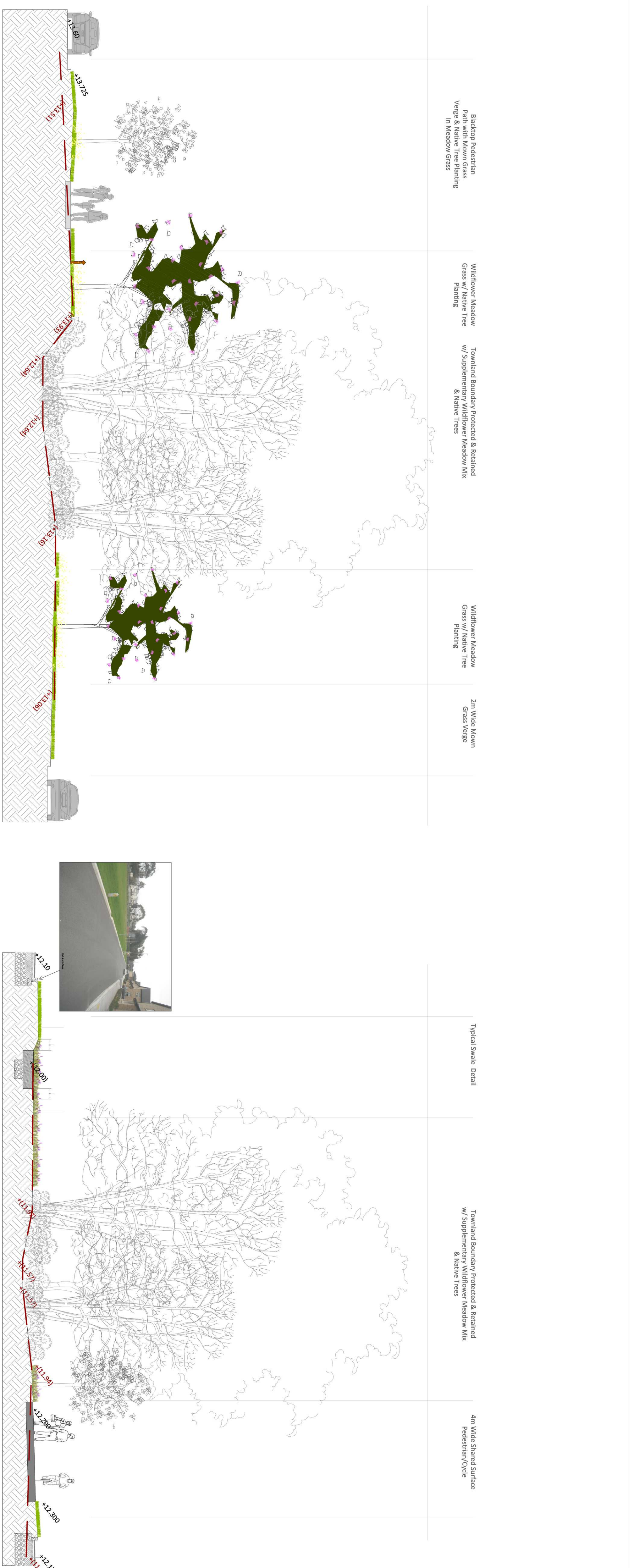
Section A-A: Linear Open Space & Townland Boundary Scale 1:100 @ A0