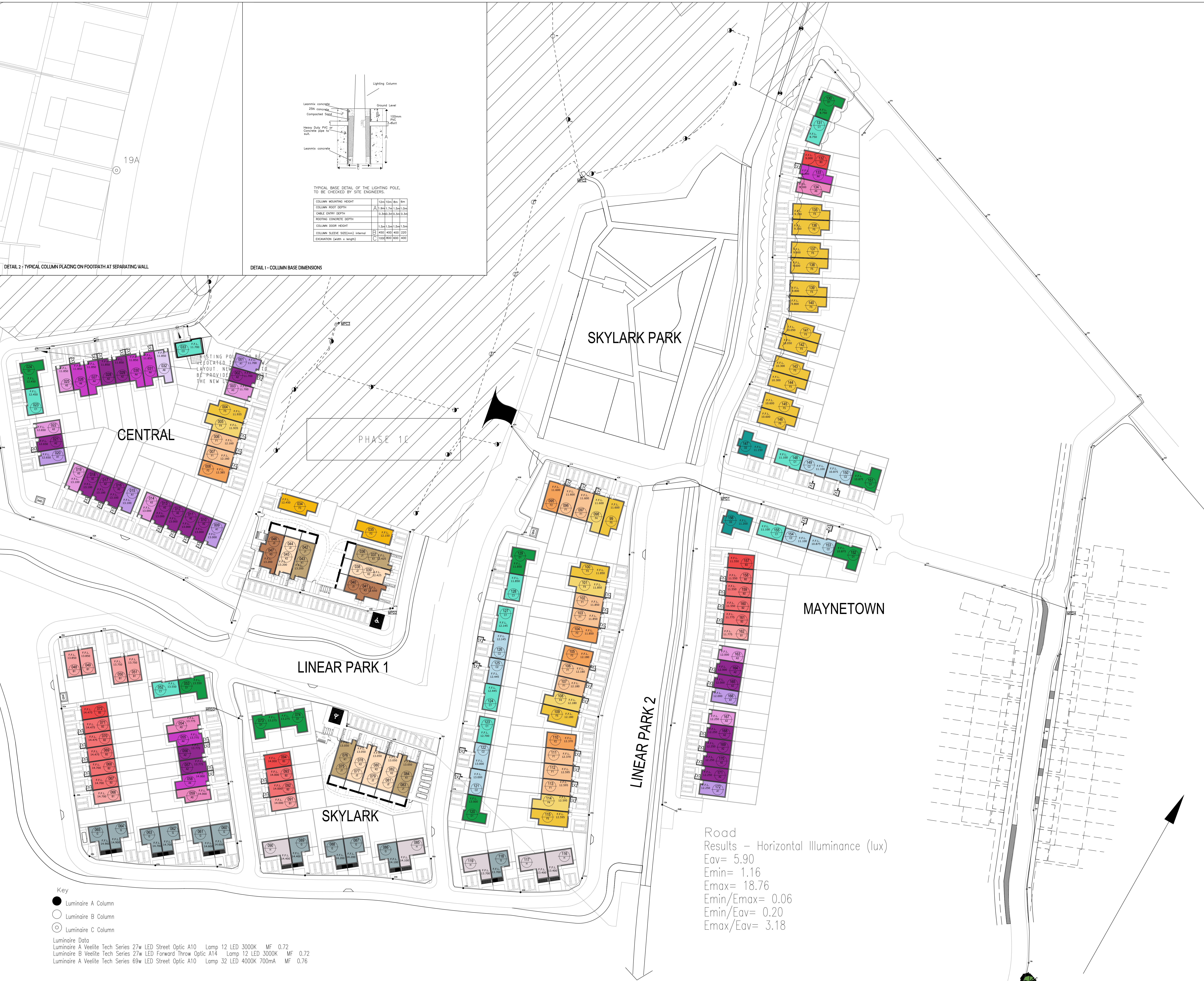
DETAIL 1 - COLUMN BASE DIMENSIONS