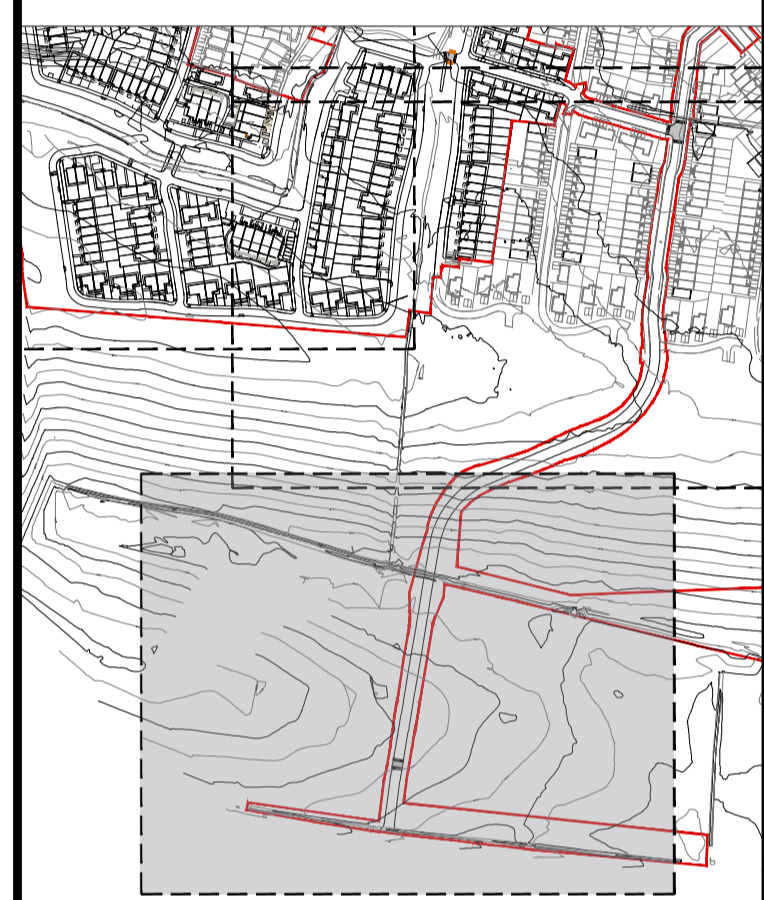
SITE LOCATION EXTRACT