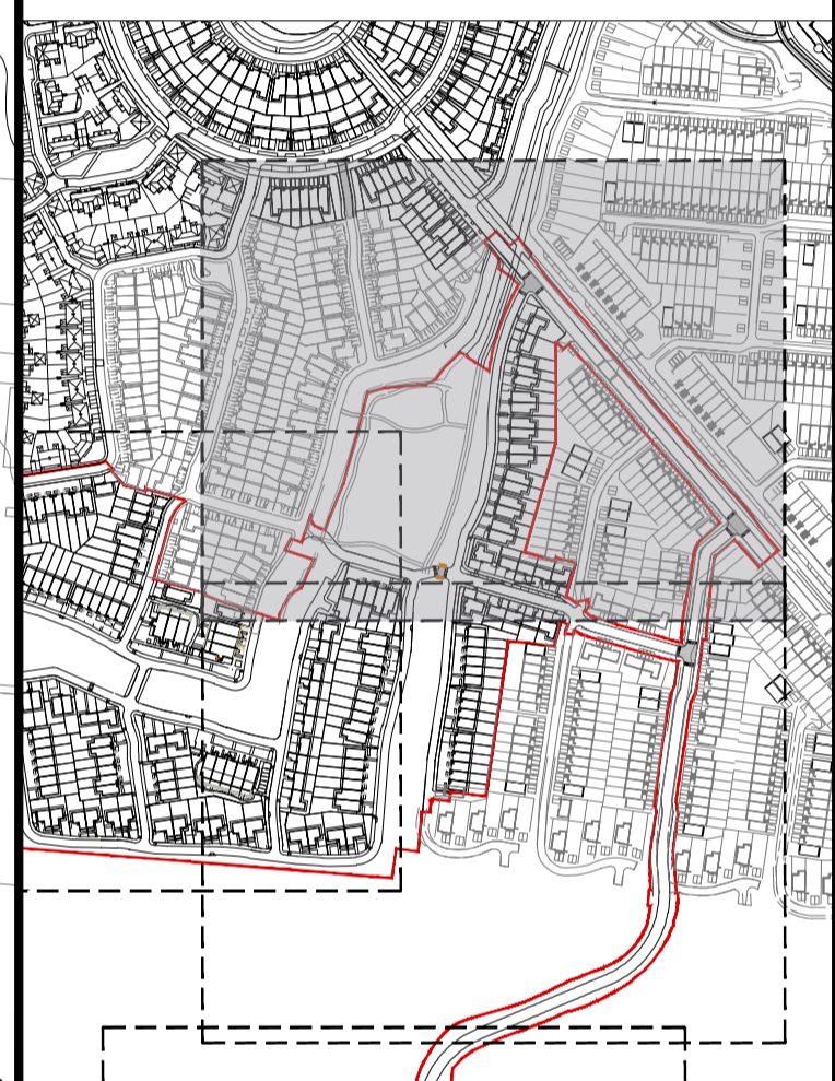
SITE LOCATION EXTRACT