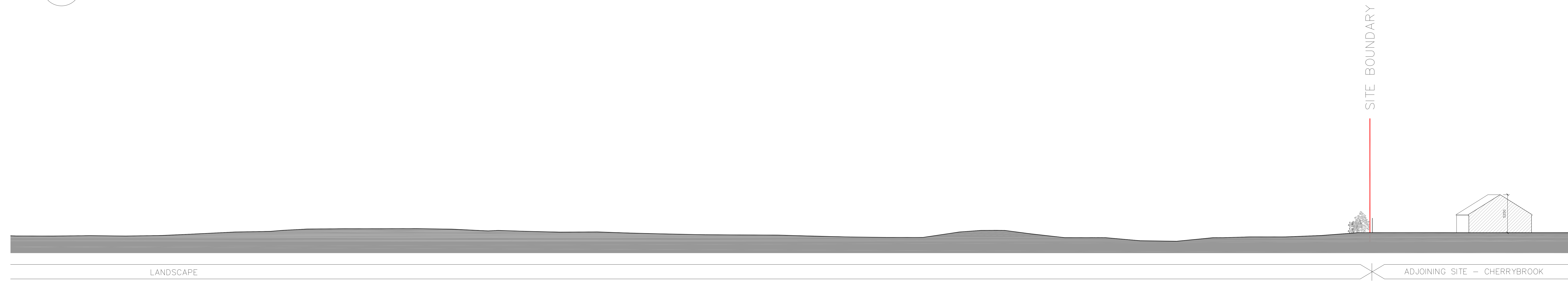
03 Existing Site Section B-B (Part 2 of 2) EX 201 1:200

ISSUED FOR PLANNING ONLY, NOT FOR CONSTRUCTION