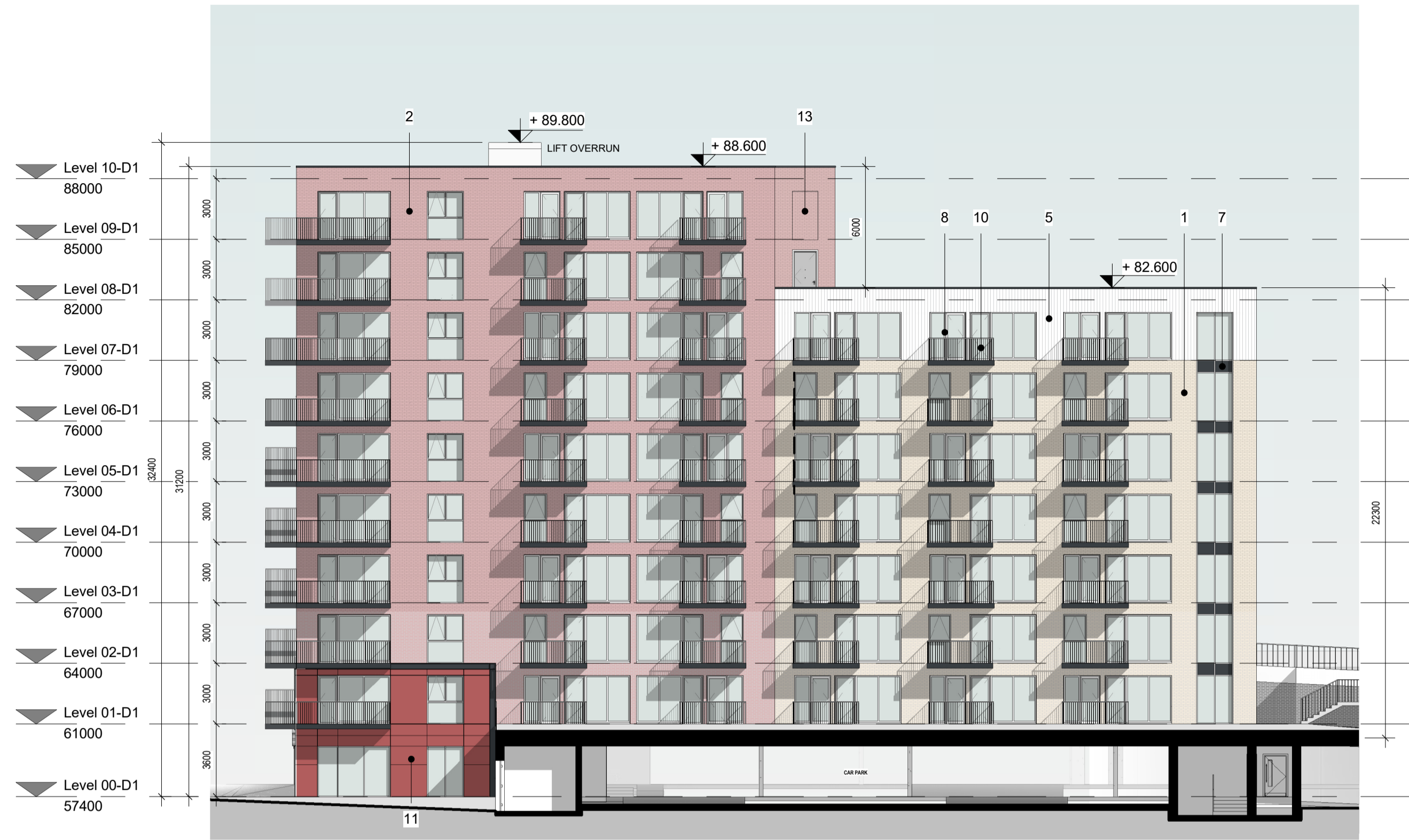
1 BLOCK D- PROPOSED EAST ELEVATION 1 : 200