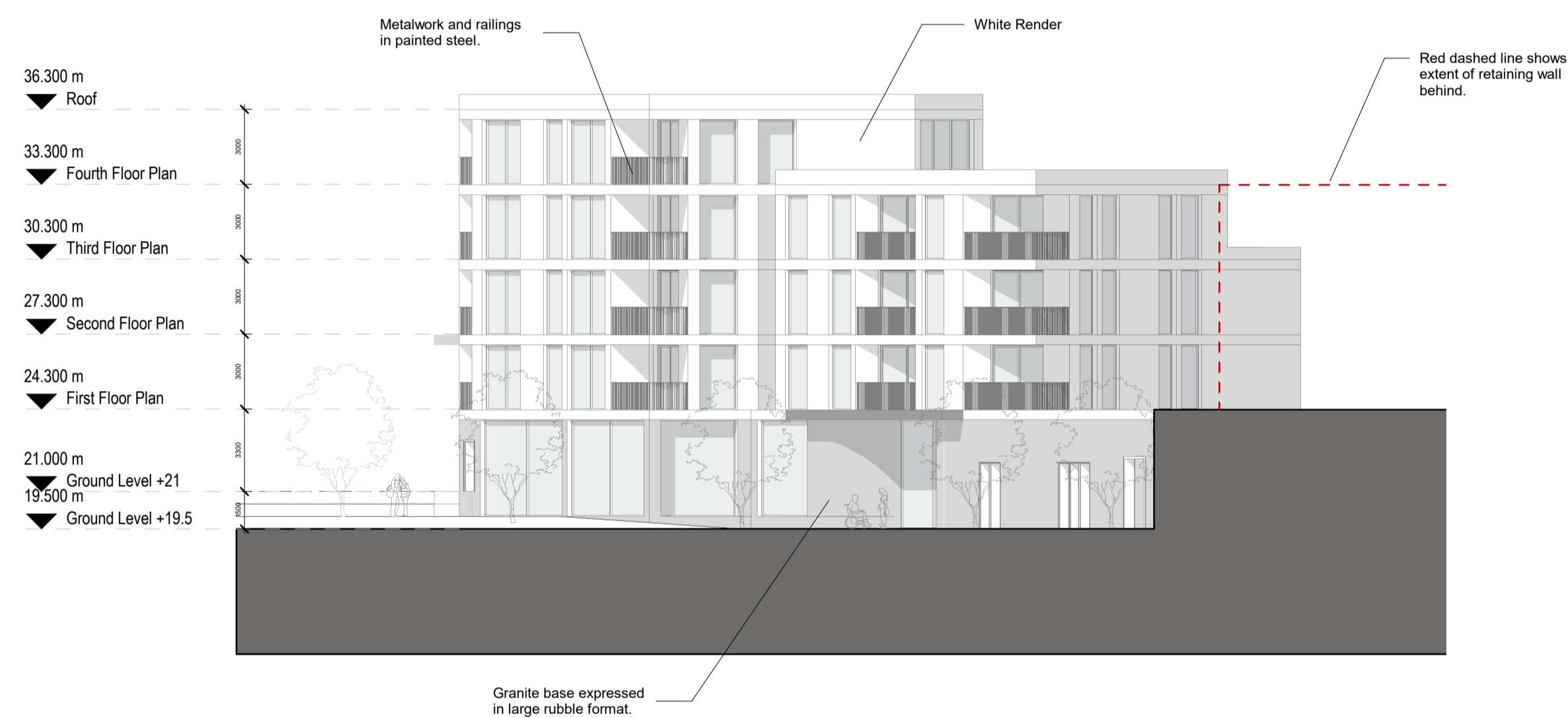
1 Proposed West Elevation 1 : 200