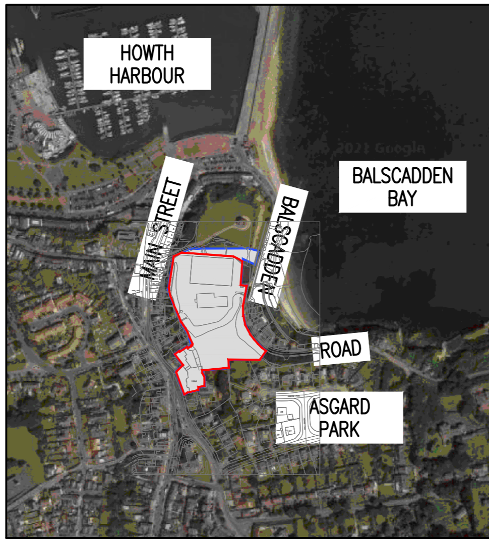
GOOGLE MAP IMAGE 1:5000