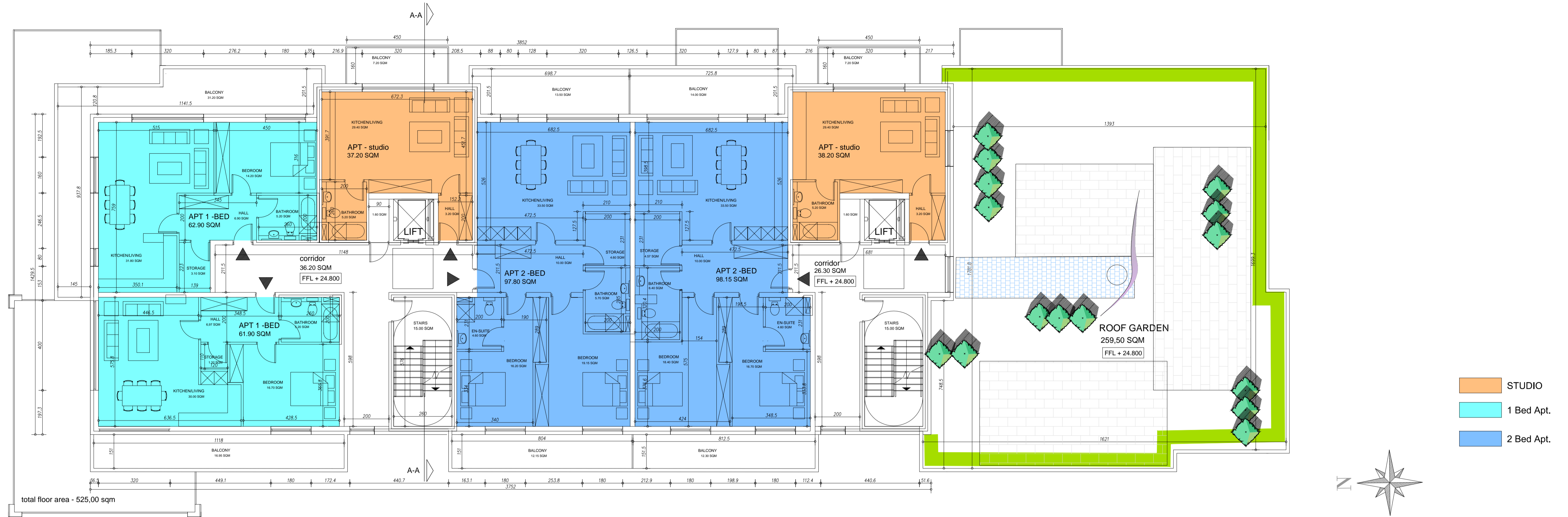
1 PROPOSED BLOCK 5 - PENTHOUSE FLOOR PLAN 1:100