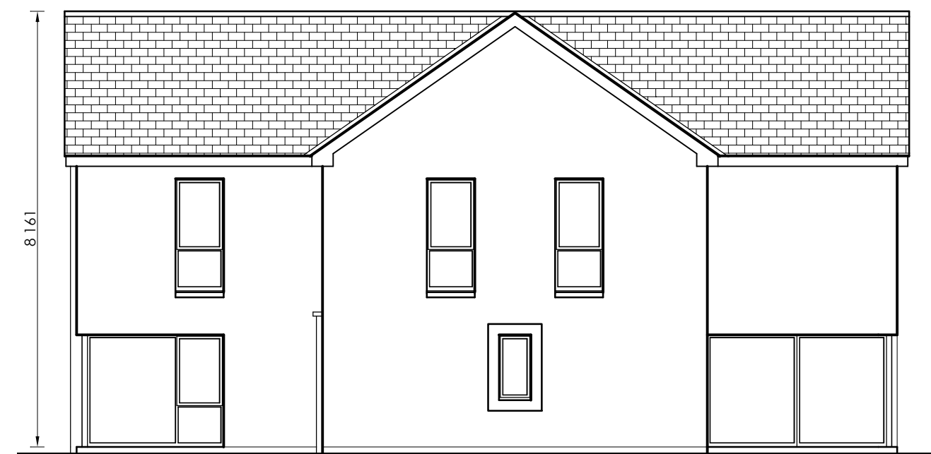
Side Elevation Scale 1:100