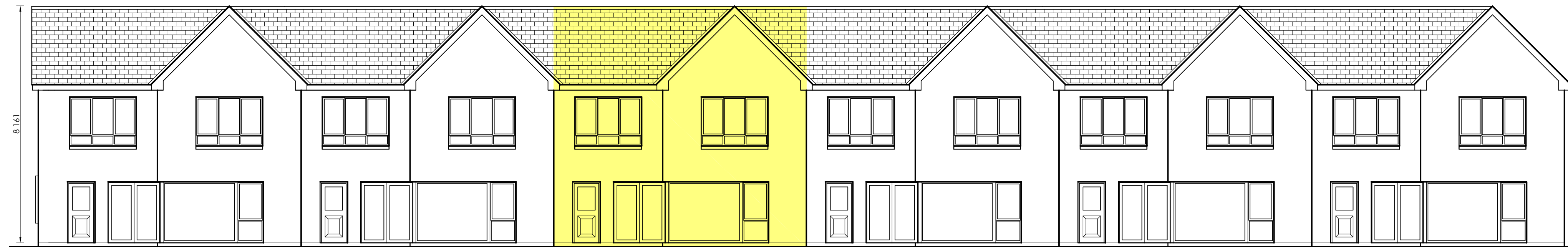
Rear Elevation Scale 1:100