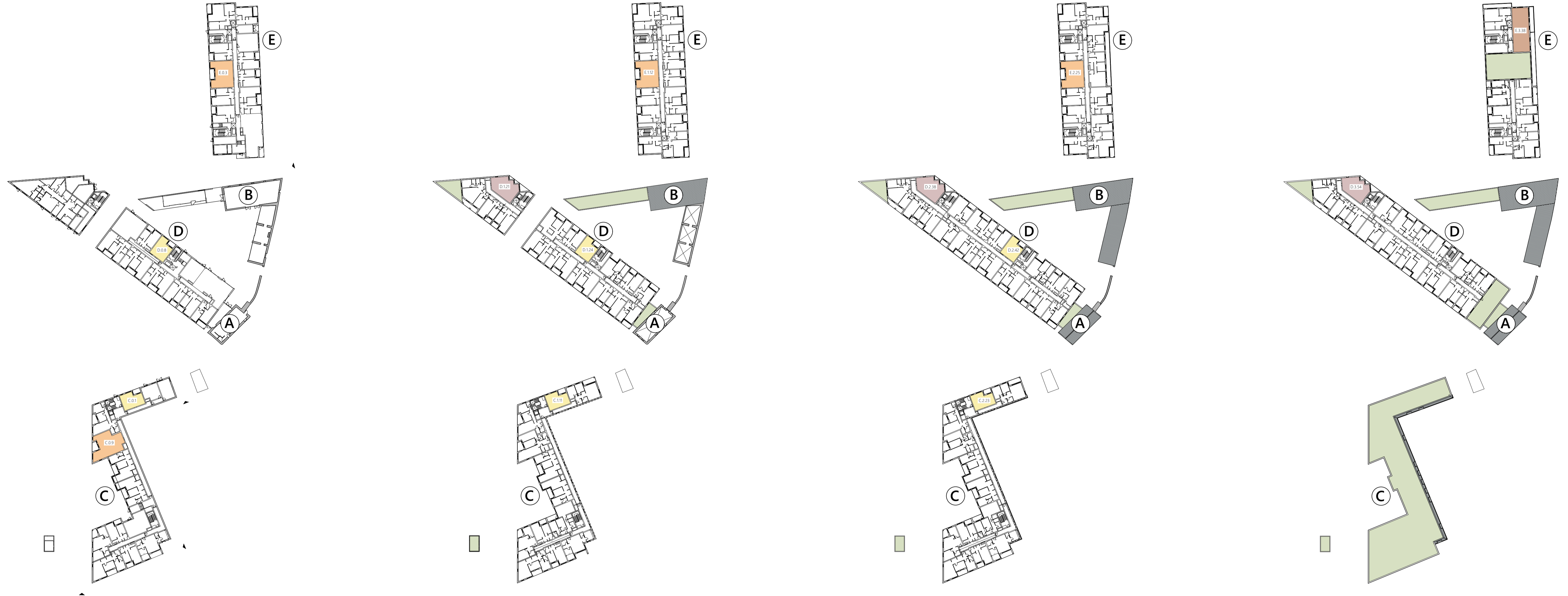
0 LEVEL 0 (GROUND FLOOR PLAN)