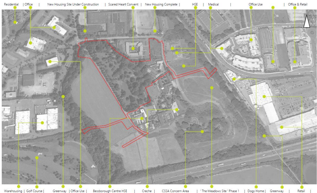
Figure 1.1 Site Context

The majority of the site is within the ' Landscape Preservation Zone ' zoning use in an area that is described in the Mahon Local Area Plan as a 'key development area', with a small infrastructure element running around the south and west of the zoning. There has been significant change in this area over recent years through the development of the N40 South Ring Road, Mahon Point Shopping Centre and Retail Park, City Gate, Lough Mahon Technology Park and Mahon Industrial Estate, in addition to various residential developments particularly in nearby Jacobs Island. It is an area where further residential development is planned and anticipated in the future.