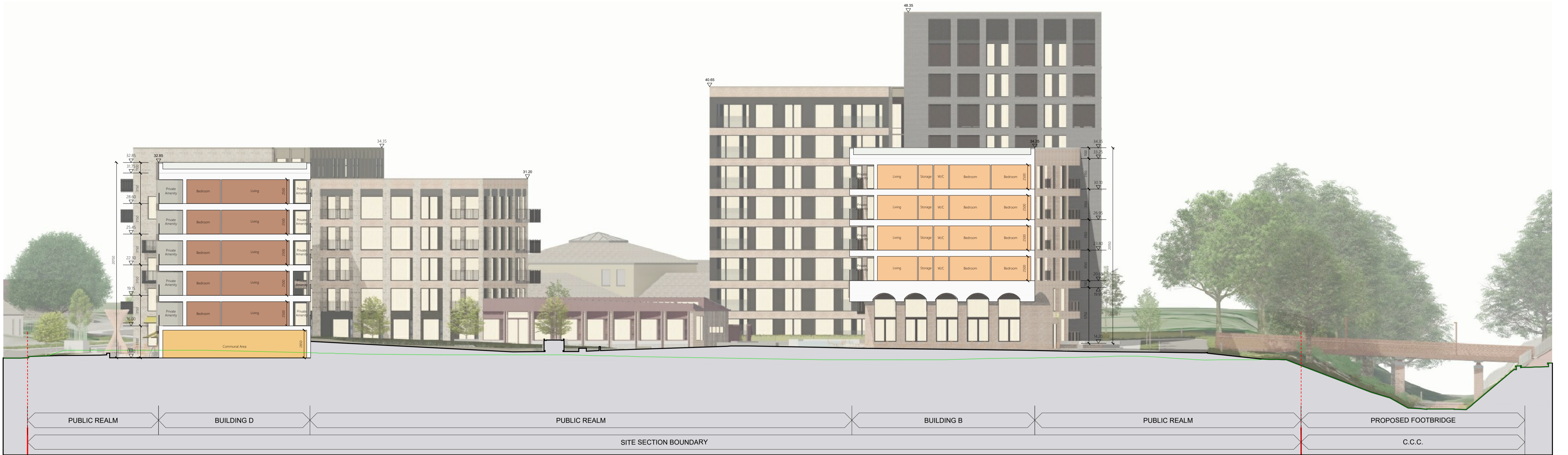
1 SECTION S1 SCALE 1:200