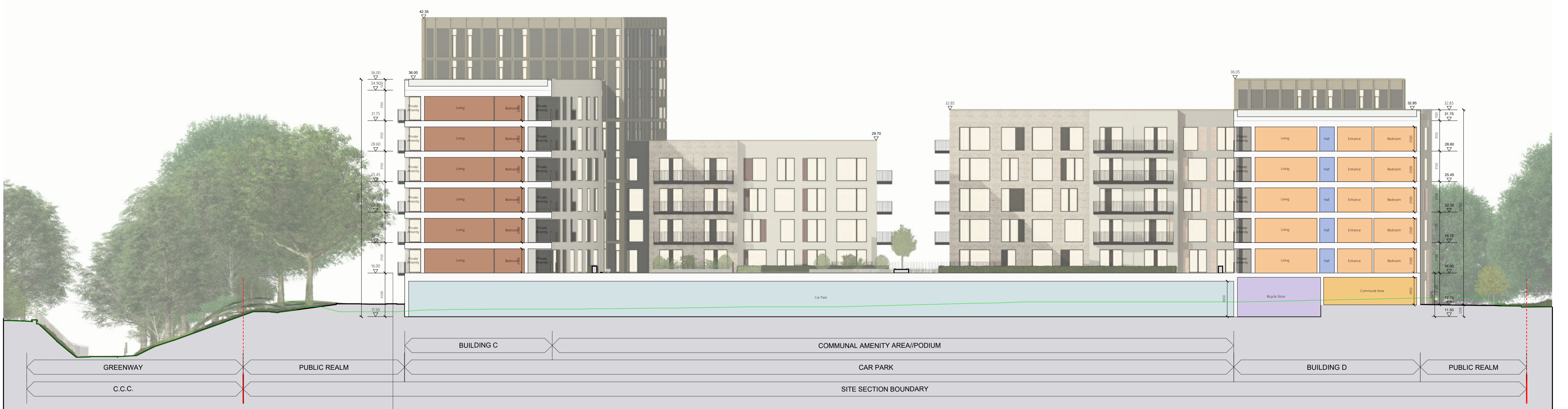
2 SECTION S2 SCALE 1:200