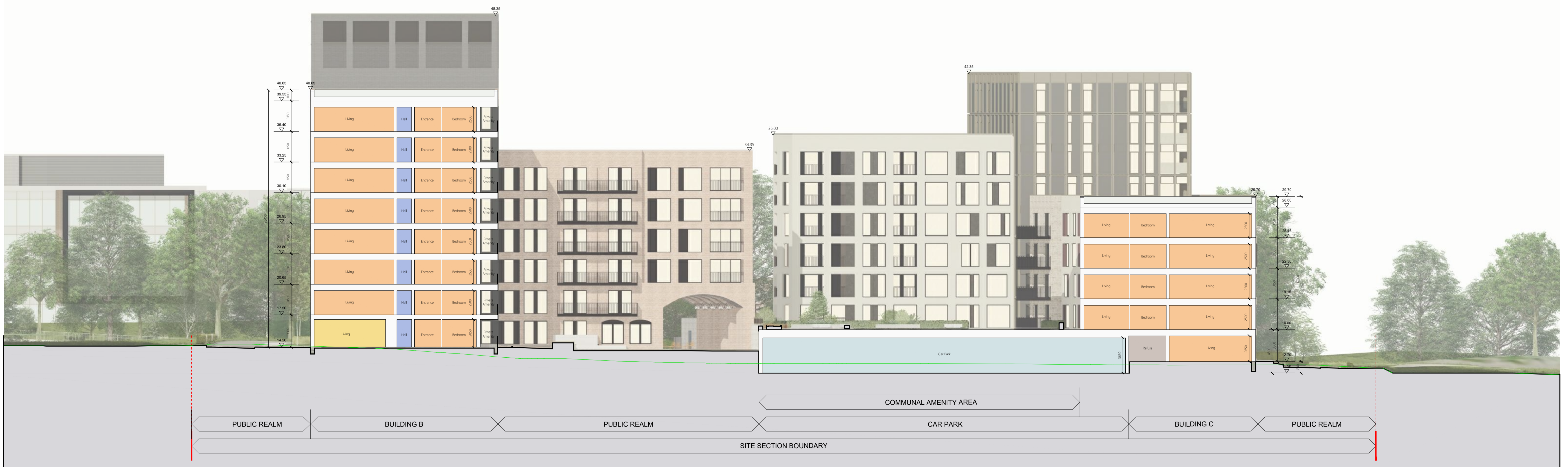
2 SECTION S4 SCALE 1:200