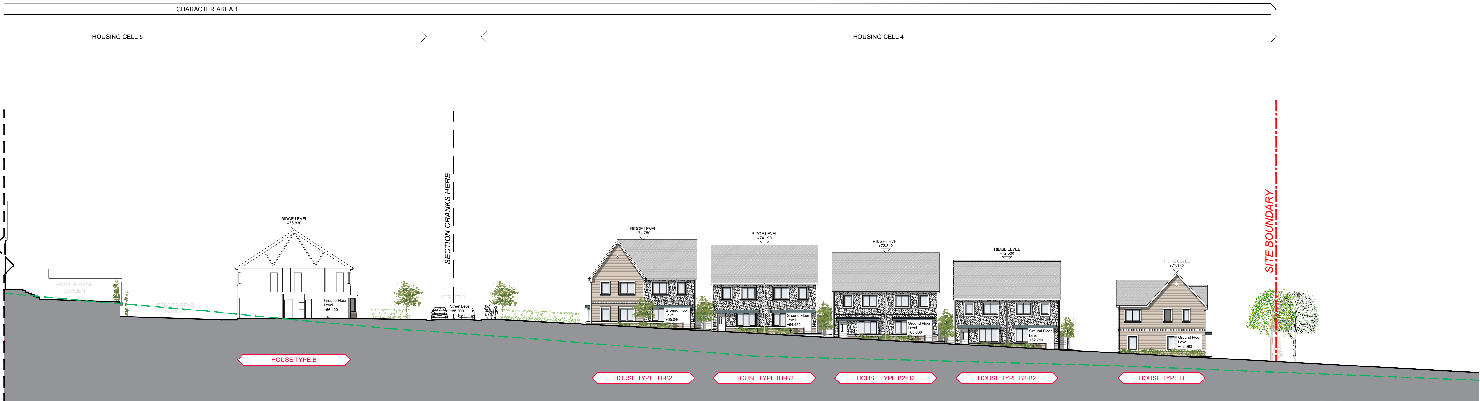
SECTION F-F (PART 2) - CHARACTER AREA 1 Scale 1:200

THIS DRAWING TO BE READ IN CONJUNCTION WITH ARCHITECT'S DRAWINGS, AND CONSULTANT ENGINEER'S DRAWINGS AND SPECIFICATIONS.