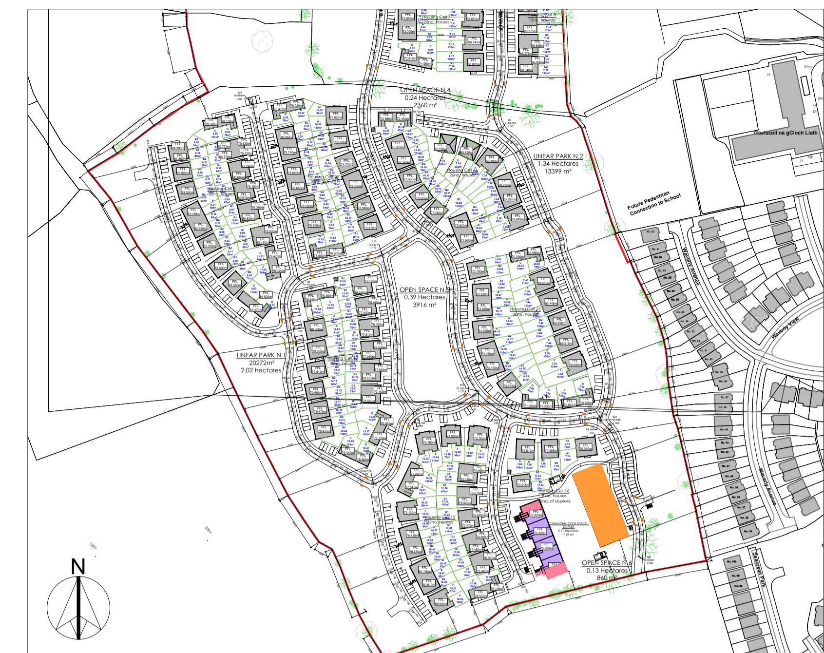
KEYPLAN - NTS