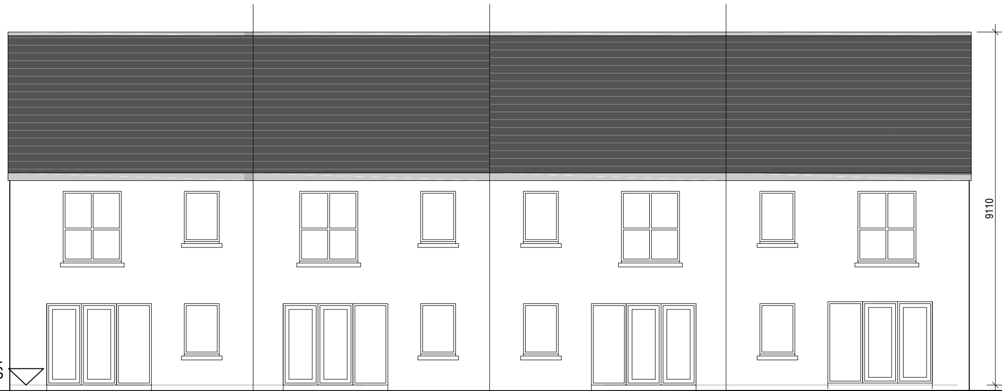
REAR ELEVATION C6 SCALE 1:100