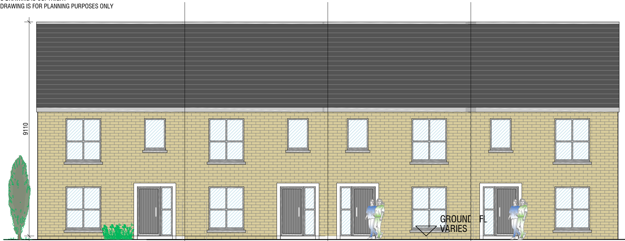
FRONT ELEVATION C6 SCALE 1:100

©THIS DRAWING IS COPYRIGHT THIS DRAWING IS FOR PLANNING PURPOSES ONLY